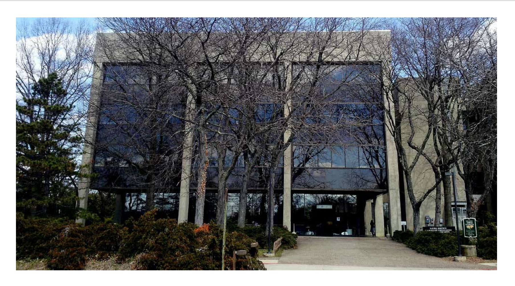
Update to Wildlife Advisory Commission June 21, 2023