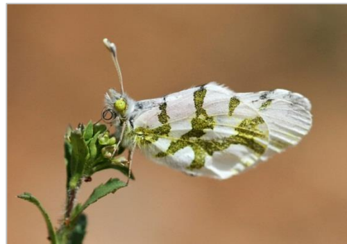
Olympia marble (Steve Collins)

Nationwide, State Wildlife Action Plans (SWAPs) are an important tool for successful wildlife conservation. SWAPs outline strategic conservation approaches for wildlife and wildlife habitats in each of the fifty states, the District of Columbia, and the five U.S. territories. "Wildlife" in the context of SWAPs includes fishes, birds, mammals, reptiles, amphibians, insects, and other invertebrates including freshwater mussels. The Maryland Department of Natural Resources (MD DNR) led the 10-year revision of this statewide guidance document. The Maryland SWAP (Plan)