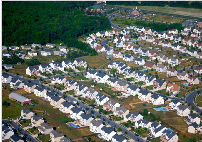
Subdivision encroaching on a forest

Although portions of the Northeast are heavily urbanized, the Northeast also includes many rural lands and relatively undeveloped areas, especially along the Appalachian Mountains. Remarkably, some portions of the Northeast remain relatively wild, with 73 federally designated wilderness areas, 70 National Wildlife Refuges, and six National Forests. In fact, 16% of the land area in the Northeast states—over 24 million acres—has already been placed in some form of protective conservation ownership (Anderson & Olivero Sheldon 2011).