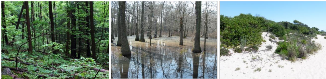
Some of Maryland's diverse habitats (from left to right): Cove Forest in western Maryland, swamp in Maryland's Coastal Plain region, and Maritime Shrubland on Assateague Island