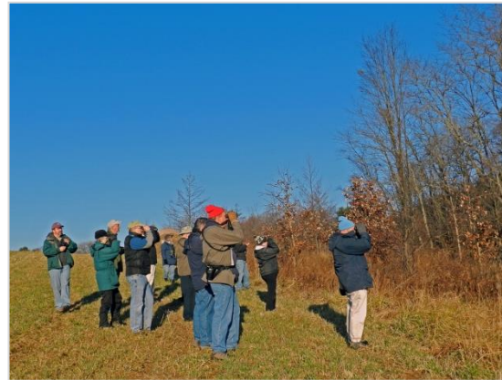
A group of birders searches for sparrows (Bonnie Ott)

While Marylanders generated $483 million from wildlife-watching activities in 2011 (U.S. Department of Interior, U.S. Fish and Wildlife Service, and U.S. Department of Commerce 2011), the Total Industrial Output (TIO), which includes direct, indirect, and induced effects, totaled over $909 million (Caudill 2011). The ratio of the TIO to direct expenditures in Maryland was 1.88, which means that for every $1.00 of direct spending associated with wildlife-watching, an additional $0.88 of economic activity was generated. The TIO of over $909 million produced 10,807 full- and part-time jobs, and generated $88.4 million in state and local tax revenue (Caudill 2011). Another measure of the net economic value of wildlife can be measured by participants' willingness to pay for wildlife-related recreation over and above what they actually spend to participate. This value increased from $40/day in 1985 to $66/day in 2001 (adjusted to 2001 dollars for comparison) for wildlife-watching activities by Maryland residents.