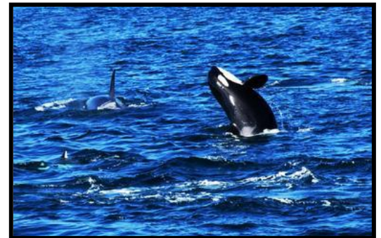
Killer whale