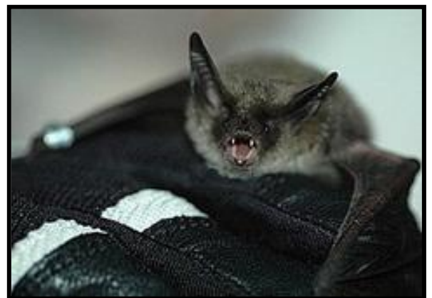
Northern long-eared bat by: Joy O'Keefe