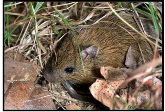
Meadow jumping mouse

Melon-headed whale Peponocephala electra