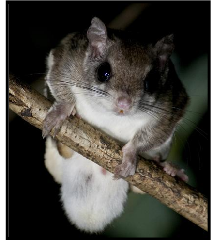
Southern flying squirrel

Eastern chipmunk Tamias striatus Woodchuck Marmota monax Eastern gray squirrel Sciurus carolinensis Eastern fox squirrel Sciurus niger Delmarva fox squirrel Sciurus niger cinereus Red squirrel Tamiasciurus hudsonicus Southern flying squirrel Glaucomys volans