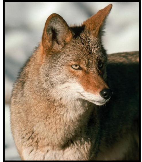
Coyote