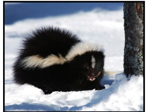
Striped skunk