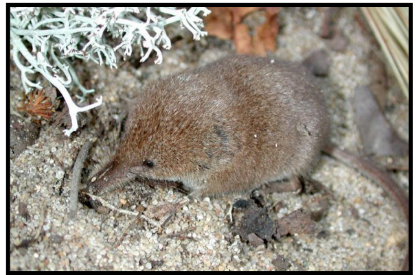
Masked shrew