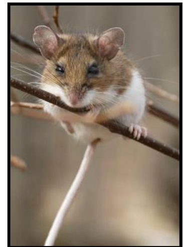
White-footed deer mouse by: Phil Myers

Marsh rice rat Oryzomys palustris Eastern harvest mouse Reithrodontomys humulis Deer mouse Peromyscus maniculatus White-footed deer mouse Peromyscus leucopus Allegheny woodrat Neotoma magister