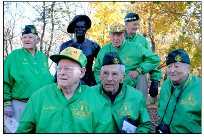
Iron Mike with the original 'CCC Boys' from the local chapter on the day of dedication.

You may have seen him in passing towards the beginning of your Quest. Follow these directions to meet this local celebrity! From the Middletown Overlook, follow the Black Locust Trail north toward the Nature Center. At the intersection with the Green Ash Trail, follow the Green Ash Trail back into the High Knob area towards the 'CCC Monument.'