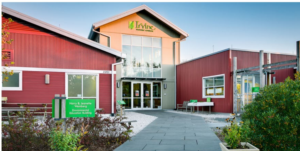
Figure 2. A photo of the Irvine Nature Center referenced in the report.