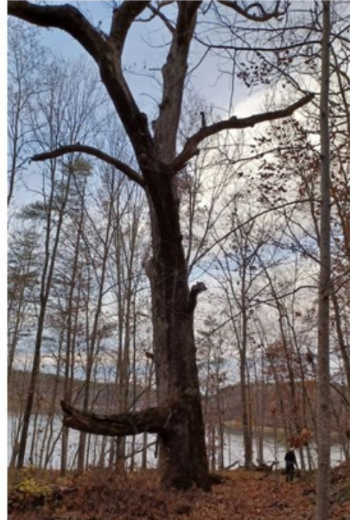
White Oak - Carroll