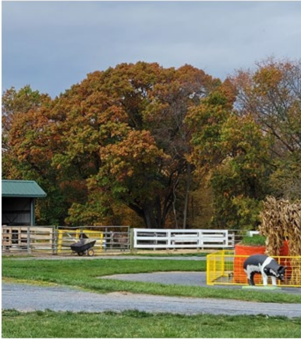
Black Oak – Frederick