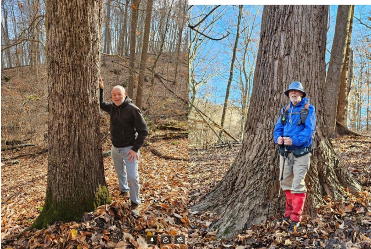
Pignut Hickory - Orange Grove, PVSP