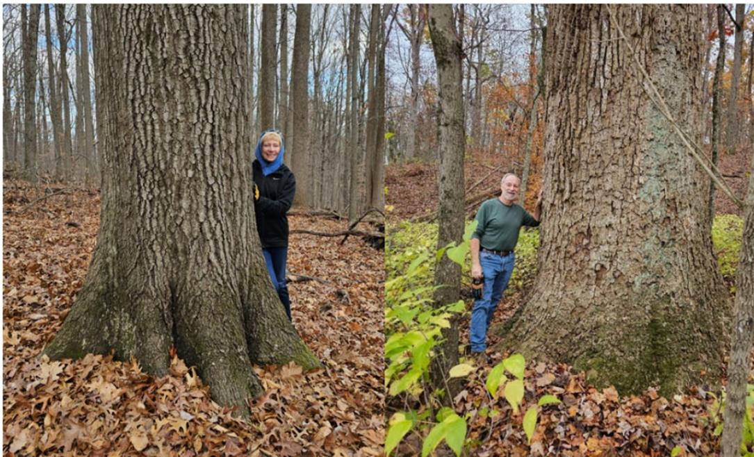
Scarlet Oak - Oregon Ridge