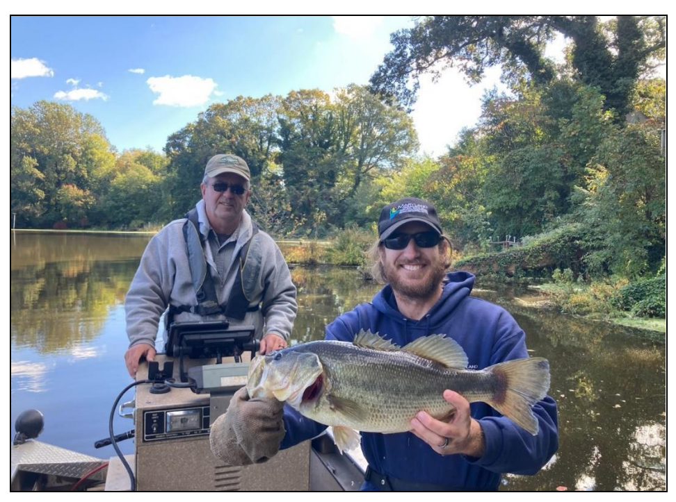
A five-pound largemouth bass sampled in Wye Mills Lake

Nesbitt Run - Sampled Nesbitt Run, a tributary to Basin Run in Cecil County to assess its wild brown trout population. Young-of-year (YOY) brown trout were quite abundant.