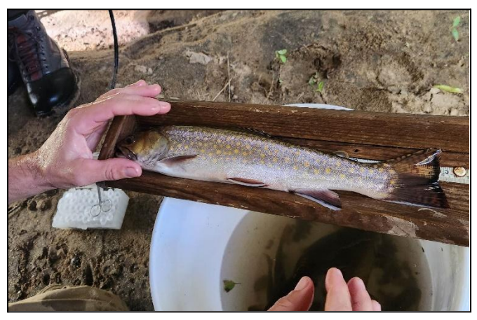
13-inch brook trout collected in Baltimore County

sites in the region. Genetic material for brook trout DNA testing was collected at two of these sites.