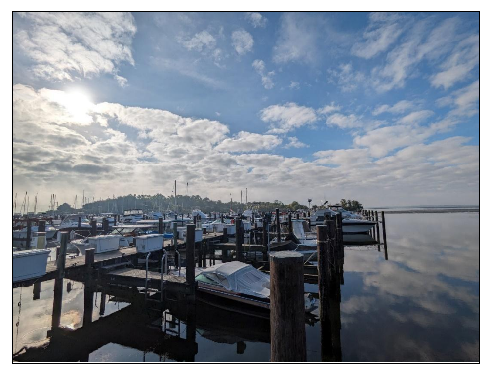
Dead calm conditions at Havre de Grace boat launch during tidal bass survey

Began Tidal Bass fall survey in the Southern Region and found some areas to have higher salinity than expected, especially in the Mattawoman Creek area where the readings were unusually high. Smaller individuals dominated the catch in several of the sites.