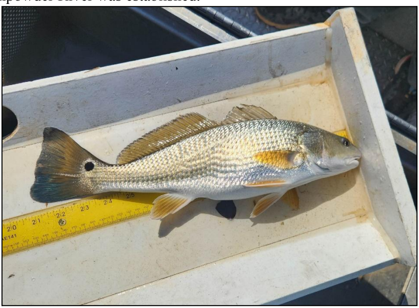
Red drum collected from the tidal Gunpowder River.

The Central Region completed their Tidal Bass Survey during the month of October. Staff sampled sites in Bush River, Gunpowder River, Middle River, and North East River. After 10 straight years of sampling, a benchmark on the largemouth bass population in the tidal Gunpowder River was established.