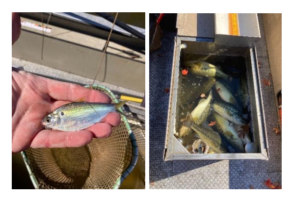
Left- A young-of-year threadfin shad. Right- A live well full of big bass from Johnsons Pond

Smithville Lake and Johnsons Pond were surveyed to assess the largemouth bass populations. Large numbers of quality-sized bass were collected from both impoundments. Smithville Lake currently also has a very robust black crappie population, most of which are between 8-12 inches which should provide excellent fishing opportunities. The number of larger bass collected from Johnsons Pond was truly exceptional this year and it should be providing great fishing for bass anglers.