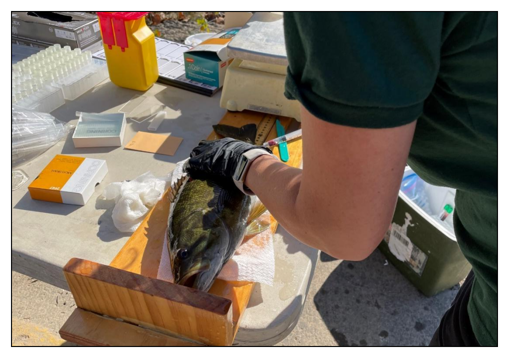
Blood collection from an adult smallmouth bass for PFAS analysis

Tidal bass and impoundment sampling has been in high gear in Eastern Region this month. Tidal bass surveys have been completed in the Northeast River, Wicomico River, and Marshyhope Creek. If weather allows, an additional survey will be completed in the Sassafras River. An interesting note was the abundance of threadfin shad seen during the surveys. Maryland is traditionally on the northern end of their range, and participating staff have never seen them in such abundance during the tidal bass survey.