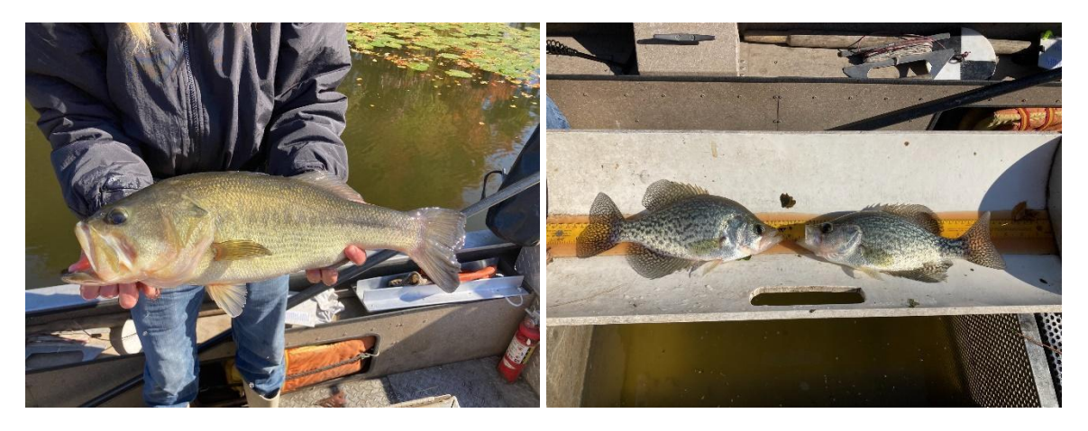
Left- A trophy-sized largemouth bass collected from an Eastern Region impoundment. Right- Black crappie collected from Smithville Lake

Completed 54 electrofishing sites on the Potomac River for the Tidal Bass project. Sites within the Mallows Bay shipwrecks area were productive for both largemouth bass and snakehead. Photo below showing a biologist weighing a snakehead captured among the wooden hull timbers and ancient steel spikes of one of the ships. This area has been highlighted in both print and film as the "Ghost Ships of Mallows Bay" and is now a stop on the canoe tour of the southern Potomac River.