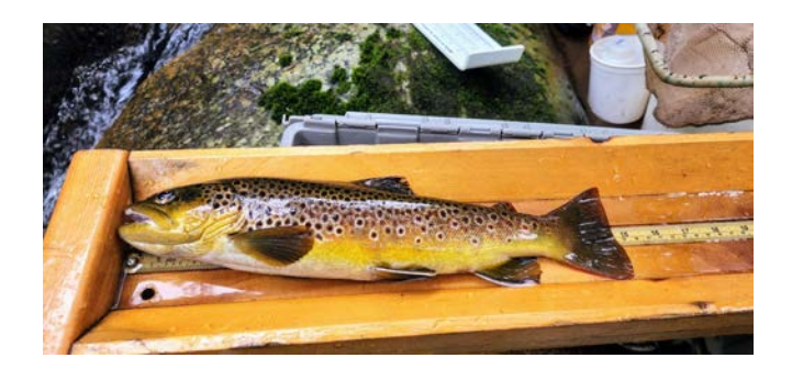
Savage River tailwater electrofishing survey; wild brown trout.

Savage River Tailwater - Regional and Brook Trout Program staff assisted the West I Region with a survey of the trout populations in the Savage River tailwater at two established sites. Natural reproduction of brook and brown trout was considered good. Quite a few adult brown trout between 14 and 17 inches were also documented. The Savage River tailwater continues to provide anglers with an outstanding fishery for wild trout.