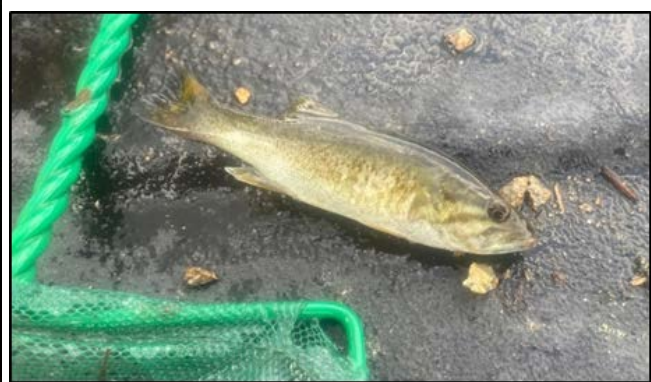
Juvenile smallmouth bass stocking on the upper Potomac River

Largemouth Bass - Stocked approximately 25,000 juvenile largemouth bass into Piscataway Creek from a boat with help from a Hutton Program scholar who is interning with the department. The bass were surplus from the Manning Fish Hatchery and will help supplement natural reproduction in that area which has had poorer bass reproduction in recent years.