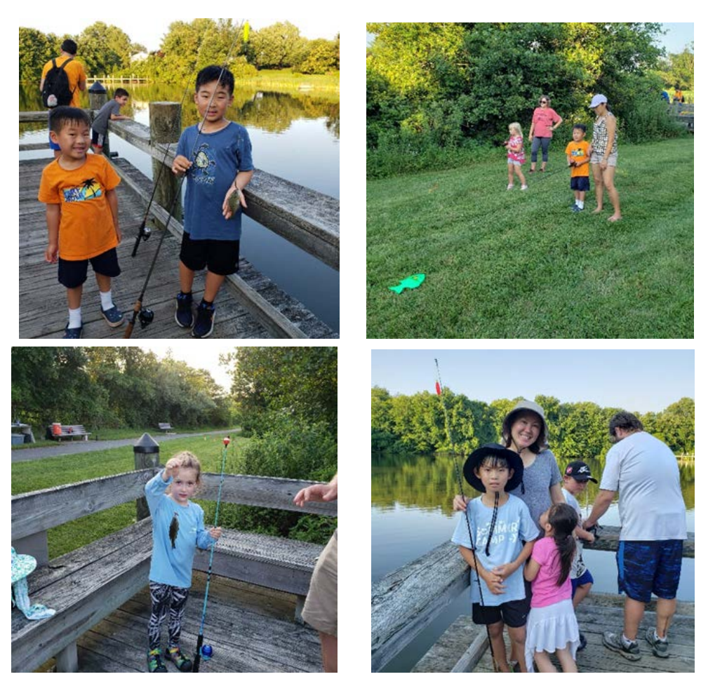
Warfields Pond Park Fishing event

Backyard Fishing Event – Collaborated with the Howard County Recreation and Parks to host a Backyard Fishing Program at Warfields Pond Park. The program focuses on teaching basic fishing skills to youth and families. The participants were instructed on fish ID, rod set-up, tackle selection, knot tying and had some casting practice before heading to the pond for some fishing. Many sunfish were caught and released during the evening.