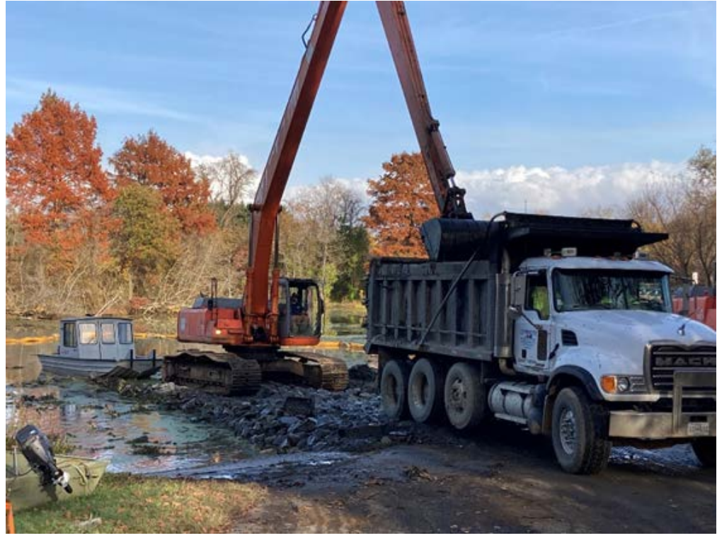
Actively removing material from Urieville Lake

Urieville Lake Reopening - Dredging work has been completed and Urieville Lake Fishery Management Area has been reopened for public use. Approximately 450 cubic yards of material were dredged from the area around the boat ramp providing easier access for small boats and improving shoreline access for anglers. A small dock was installed to assist in boat launching and retrieval, as well as improve fishing access. The improvement in bottom substrate will provide enhanced spawning habitat for nesting fish like largemouth bass and bluegill. The project was funded by the State Lakes Protection and Restoration Fund.