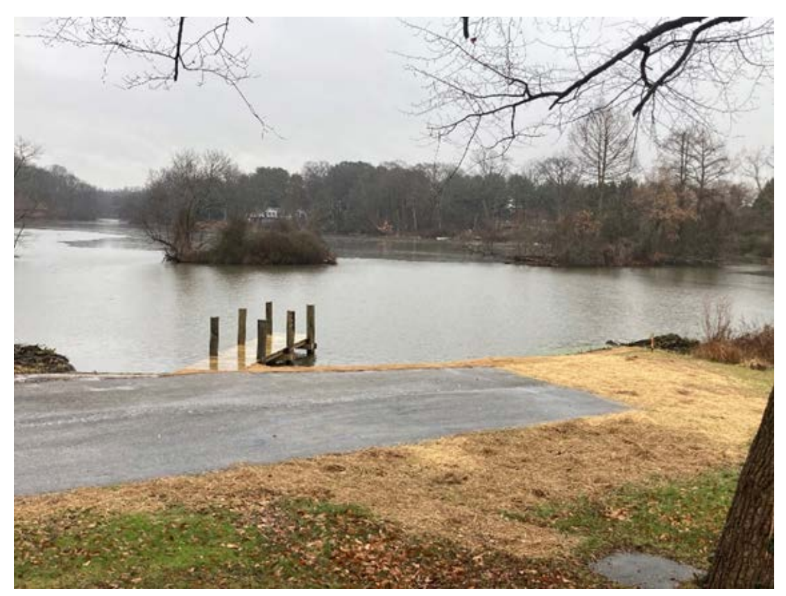
Improvements to the boat ramp area