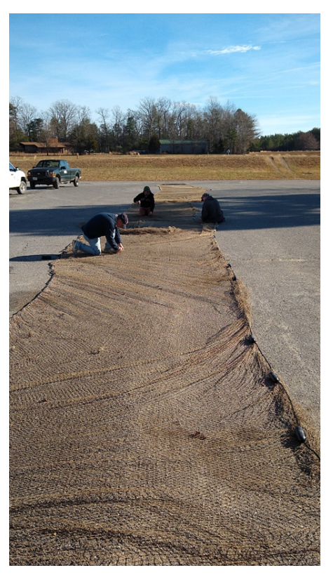
Staff mends seines in preparation for trout harvest. Basically, sewing a bunch of holes together.

Black bass angler Rob Dahlin was randomly selected to win a $25 Bass Pro Shops gift card for reporting a tagged largemouth bass as part of an interjurisdictional effort to monitor the largemouth bass population on the tidal Potomac River.