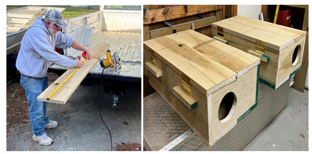
Constructing catfish spawning boxes.

The hatchery fish transportation truck had annual service and DOT inspection performed this month. DOT inspections are performed to ensure commercial vehicles are in a safe working condition.