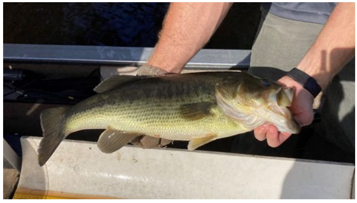
A quality bass from Johnsons Pond