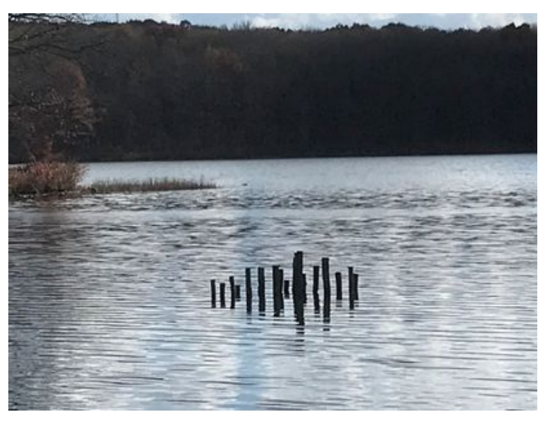
Tree post fish habitat structures in Broadford Lake

Fish Habitat Enhancement - The fish habitat project on Broadford Lake is complete. The fish habitat posts were installed with the cooperation of the Town of Oakland. Anglers have already been observed fishing these structures and they also have shown to be popular perch sites for great blue herons and belted kingfishers.