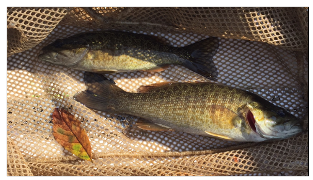
Smallmouth bass collected at McCoys Ferry on the upper Potomac River

Loch Raven Reservoir - Conducted a nighttime electrofishing survey on Loch Raven Reservoir (Baltimore County) for largemouth and smallmouth bass. Nineteen random sites around the entire perimeter of Loch Raven Reservoir were surveyed over three nights. Along with largemouth and smallmouth bass, numerous chain pickerel, black crappie, yellow perch, white perch, bluegill sunfish, and one northern pike were observed during the survey. Northern snakehead were also documented in the reservoir for the first time. Three snakeheads in total were collected at different sites.