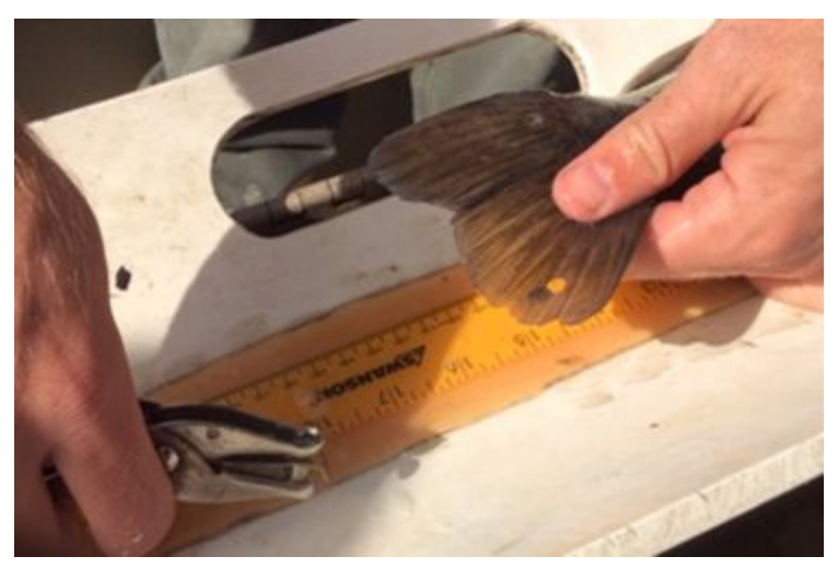
Marking a largemouth bass from Tuckahoe Lake with a "cutting edge" fisheries science tool

populations. Both impoundments contain plenty of forage and the bass were in excellent physical condition. Bass anglers should be quite pleased with the fishing at either impoundment. Unfortunately, northern snakehead were collected for the first time from both Tuckahoe Lake and Johnsons Pond. Numbers at this time appear to be low in both impoundments - future studies should allow staff to monitor snakehead abundance over time and potential impacts to other species. Stay tuned.