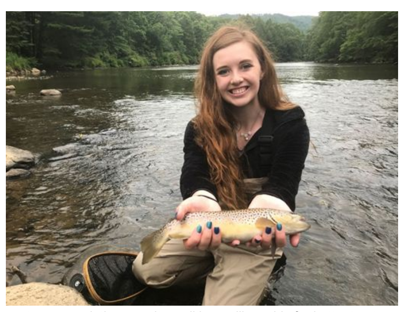
New water appropriation permit conditions will provide for better trout survival in the Youghiogheny River Catch-and-Return Trout Fishing Area.