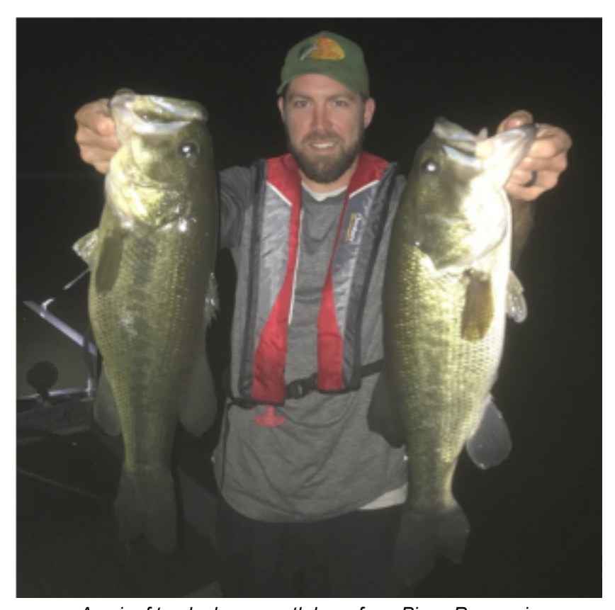
A pair of trophy largemouth bass from Piney Reservoir

Piney Reservoir - This Garrett County reservoir was surveyed for largemouth bass population densities using an electrofishing mark and recapture technique. Piney Reservoir supports an exceptional largemouth bass population characterized with a large percentage of bass greater than 15 inches. The reservoir also supports an abundant yellow perch population, as well as bluegill, pumpkinseed, and white crappie. Staff observed numerous striped bass juveniles from the July 2020 stocking - most were in the four to six inch size class. Anglers have reported catching larger striped bass from stocking in previous years.