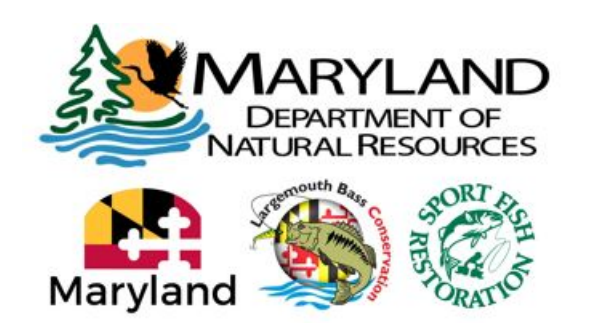
Stocking Locations 2020.

customerservice@maryland.gov Questions? 1-800-688-3467