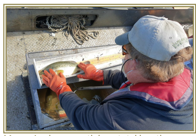
Measuring largemouth bass total length.

The <u>Tidal Bass Program</u> uses boat electrofishing to sample largemouth bass during fall. Data are used to assess the status of the population. The assessments that follow include results from the Tidal Bass Survey as well as information reported by tournament directors and anglers.