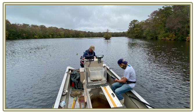
Staff electrofishing during Tidal Bass Survey.

The catch index for age 1 and older bass was greater than the previous seven years of monitoring. Unfortunately, less than one third of the sites surveyed had juveniles, which were also less abundant than in previous years. While not unusual for the area, this finding further supports observations of limited spawning habitat in tidewater of Gunpowder River. Growth indices showed healthy bass. No fish were found with lesions or hooking injuries. Because of steady increases in catch indices and normal levels of growth and robustness, the population status of bass in tidewater of Gunpowder River is good.