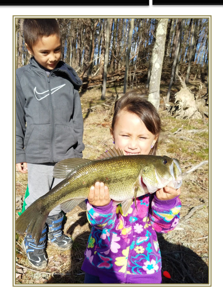
Spend More Time Fishing

Anglers weighed an average of between one and three bass per angling-day from upper Chesapeake Bay. Anglers who fished the Potomac River weighed an average of between two and three bass per angler-day. Prior to releasing fish, water quality in fish recuperation tanks and release sites generally – but not always – exceeded standards.