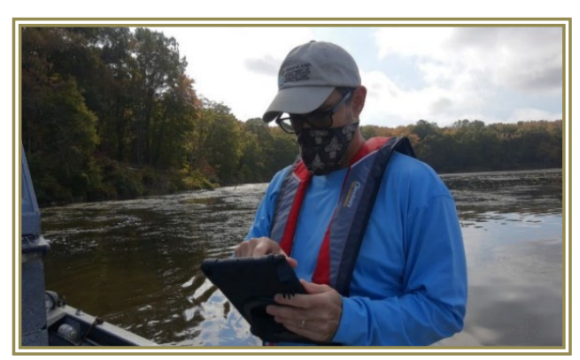
Recording data on Pocomoke River.

Three of forty-four fish had lesions, with one having a relatively high level of infection. While sample size was low, tournament catches during the 15-inch and 12-inch seasons averaged between 2 and 2.5 bass per fishing day, which is normal for this fishery. Because of low catch measured by the Tidal Bass Survey, but good growth metrics and normal catch rates reported by tournament anglers, the population status of bass in Pocomoke River is good.