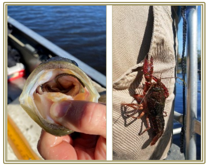
Largemouth bass eats all kinds of food, not just fish. Also crayfish (right) and the occasional rodent that falls into the water.

Bass differ in body condition because of what and how much they are eating. When a bass is fighting severe disease or infection, it may be underweight. Body condition can also indicate issues with forage, water quality, or habitat.