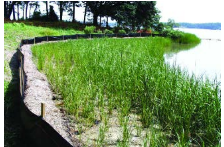
Newly planted marsh with fiber logs allowing plants to establish root system and stabilize shoreline.