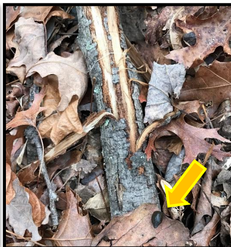
Incisor Scrape w/ Scat