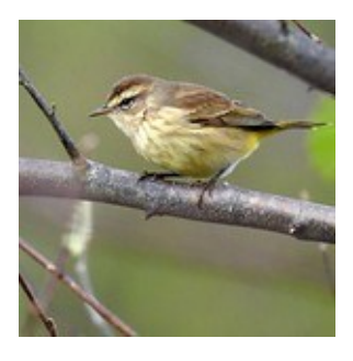
Palm Warbler