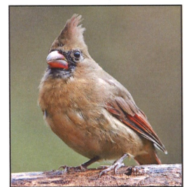
N. Cardinal (Female)