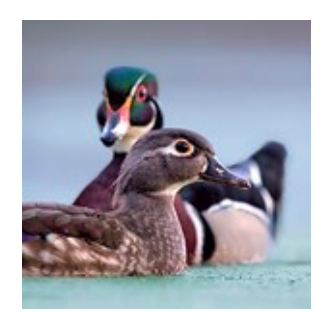
Wood Ducks