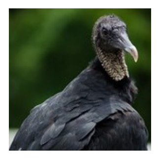
Black Vulture