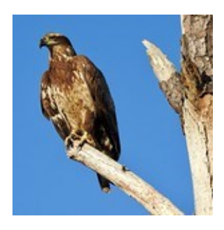
Juvenile Bald Eagle