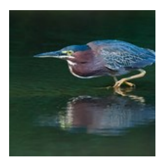
Green Heron