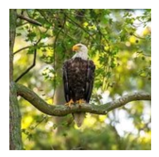
Adult Bald Eagle