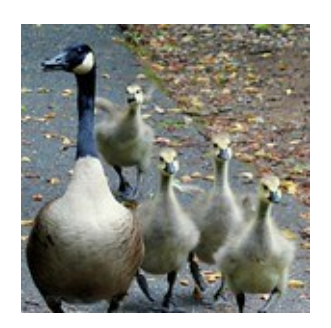
Canada Goose