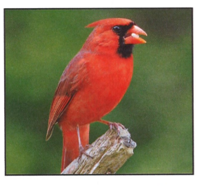
Northern Cardinal (Male)