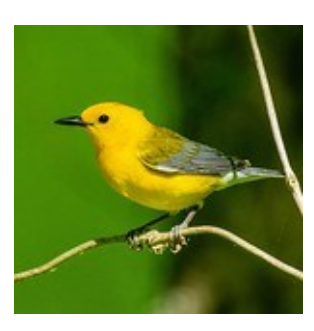
Prothonotary Warbler