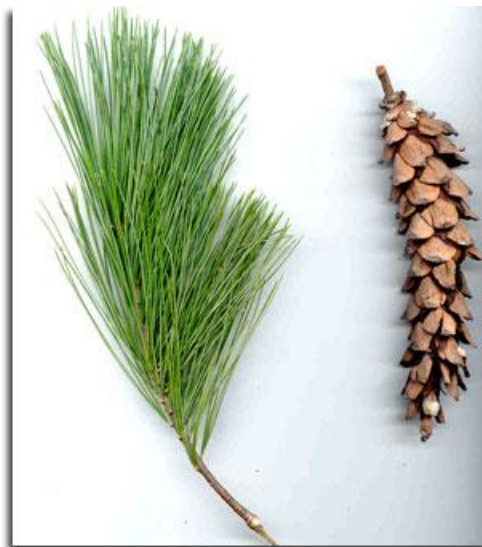
White pine ( Pinus strobus ) by Kerry Wixted

To start out, find a long piece of cardboard to use for a conifer quest board. Take a marker and write 'Conifer Quest' at the top of the board. Punch two holes, a quarter inch apart every six inches down the center of the board. Put twist ties through the holes. Next, go exploring! When a conifer is found, take a small sprig and attach it to the board using the twist ties. Be sure to only grab small amounts of the tree and make sure to have permission to take parts of trees on other people's property. Feel free to attach any cones that might be found as well. Try to identify the trees using a book like Peterson's First Guide to Trees or by using a key online. Write the name of the tree under each sprig as well as a description of the tree such as what the needles look like and anything unique about the tree.