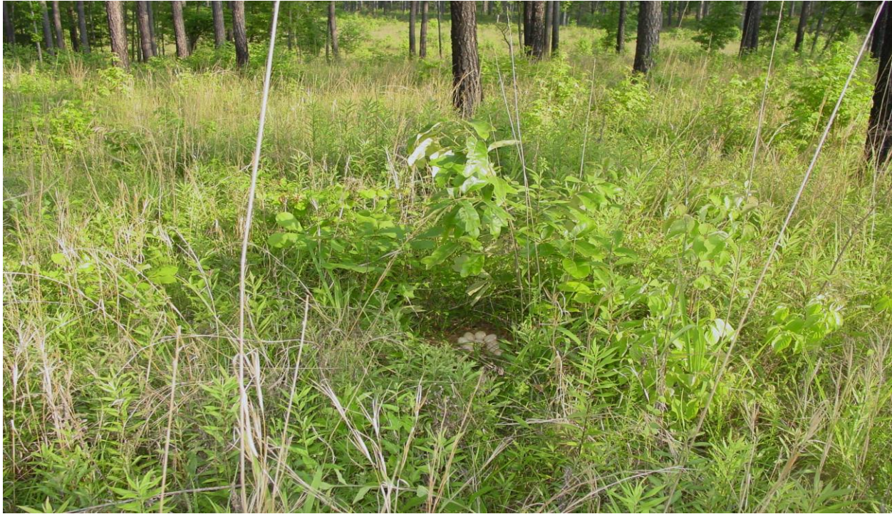
Turkey nest in pine forest with 2 year fire rotation

Care should be taken to leave desired nesting cover each year. Generally, prescribed burn units should be less than 60 acres in size; however, good quail habitat can be maintained in larger burn units (up to 80 acres) if undisturbed upland sites (1 to 5 acres in size) are maintained and well distributed throughout the burn unit. Ideally, 25 to 50% of the site should provide quality nesting cover. This can be accomplished by placing firelines around desired habitat patches within a burn unit. Some managers refer to these as “ring-arounds.” Ring-arounds may also be used to maintain good patches of shrubby cover in small 50’ by 50’ foot “covey headquarters” areas distributed evenly within burn units. If you can picture a checker board, envision 1 in 5 of the squares, spread evenly through an area, maintained in good shrubby cover, 2 of 5 squares in good nesting cover, and 2 of 5 squares in good brood rearing cover, whether within woodlands, or in open land settings.