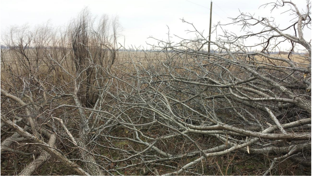
A view of edge feathering from inside tree line

Kill existing grass/vegetation (regardless of type) before edge feathering with an approved herbicide. This provides good growing conditions for annual food plants and shrubs. All trees over 15 feet tall in the area should be edge feathered, making sure native shrubs are left undisturbed. An occasional tree may be left to preserve valuable timber or mast producing species. Generally, treat all cut stumps with an approved herbicide to prolong the benefits of edge feathering. If possible, leave felled trees where they fall. Felled trees may be dropped parallel to the fence line/field edge or cut and loosely stacked along the edge of the field. Do not push the downed trees into a dense brush pile. Edge feathering may be completed with a chainsaw or mechanical clipper.