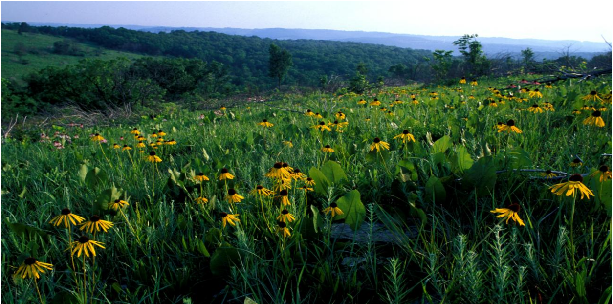
Wildflower glade on a south facing slope above and rocky glade below – photos from MDC

to restore and maintain woodland. Prescribed burning will promote herbaceous plants for nesting and brood-rearing cover and control excessive woody growth. Some use of herbicides may be required to adequately control hard wood stump / root sprouts and maximize the effectiveness of subsequent prescribed burning.