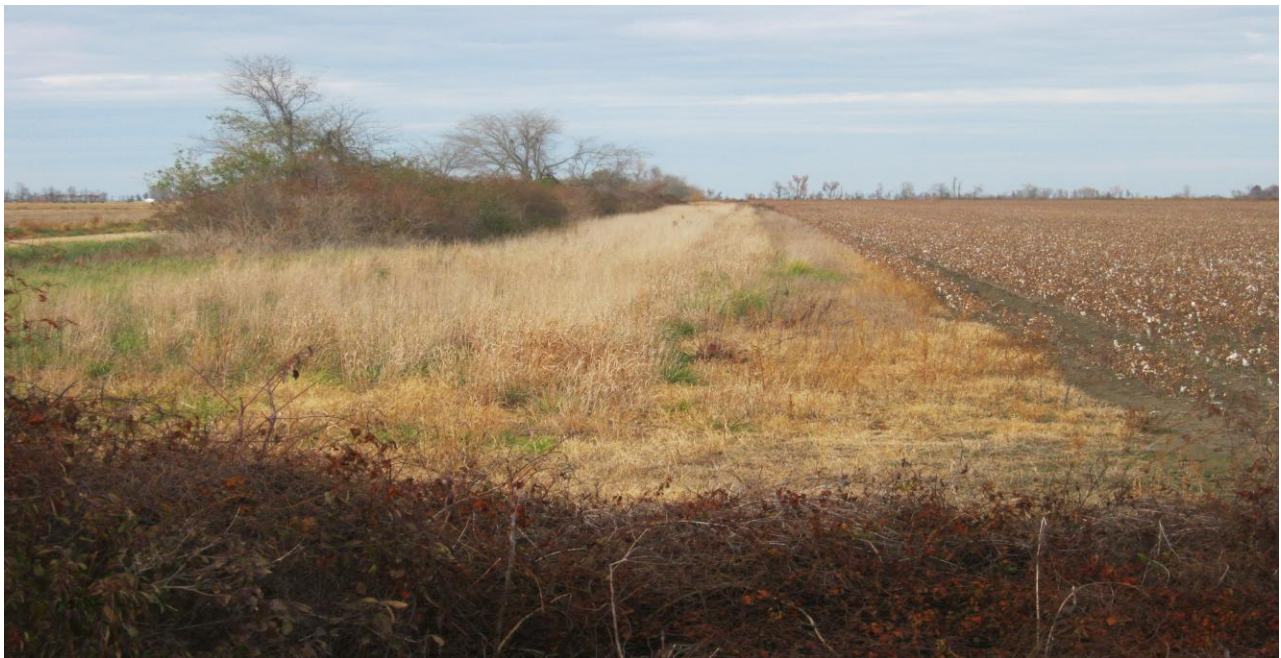
Native grass/shrub buffers improves water quality/wildlife habitat

Field Borders and Buffers – The typical “hard” edge between crop fields and woodlands offer little habitat for quail. Establishing native grass and wildflower field borders and buffers or allowing the area to naturally revegetate in grasses and seedy plants provides excellent nesting and roosting cover for bobwhites.