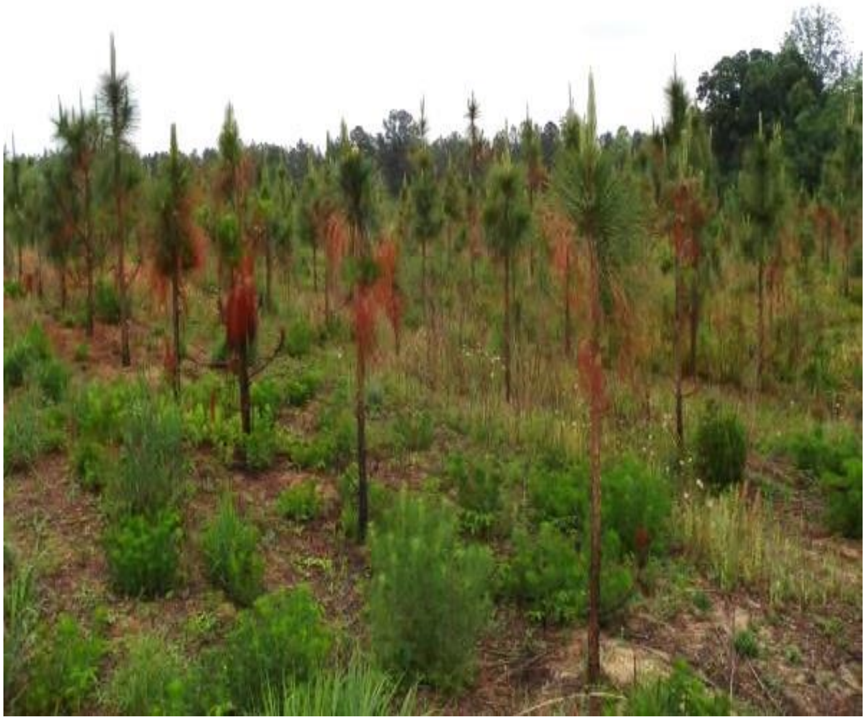
5 Years Old CRP Burned Twice – enhanced ground cover and much improved longleaf growth form