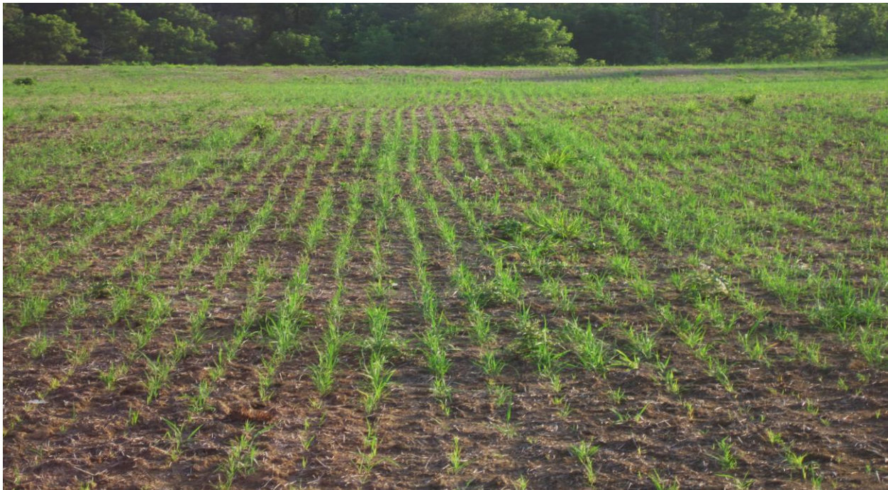
Sprayed twice and burned before planting – photo by Andrew Rosenberger, VDGIF

The key to establishing native grasses and wildflowers is to prepare a seedbed free of plant competition. Often multiple herbicide applications are necessary if sod forming grasses are present. If desirable native vegetation such as bunchgrasses and wildflowers are present consider managing the existing stand instead of establishing more native grasses. Remnant stands can be rescued by eradicating undesirable cool-season grasses with glyphosate in the fall after a killing frost or by applying selective herbicides during the growing season. Make sure to read and follow label directions when applying herbicides. It is difficult and expensive, if not impossible to salvage native vegetation on sites infested with exotic warm-season grasses.