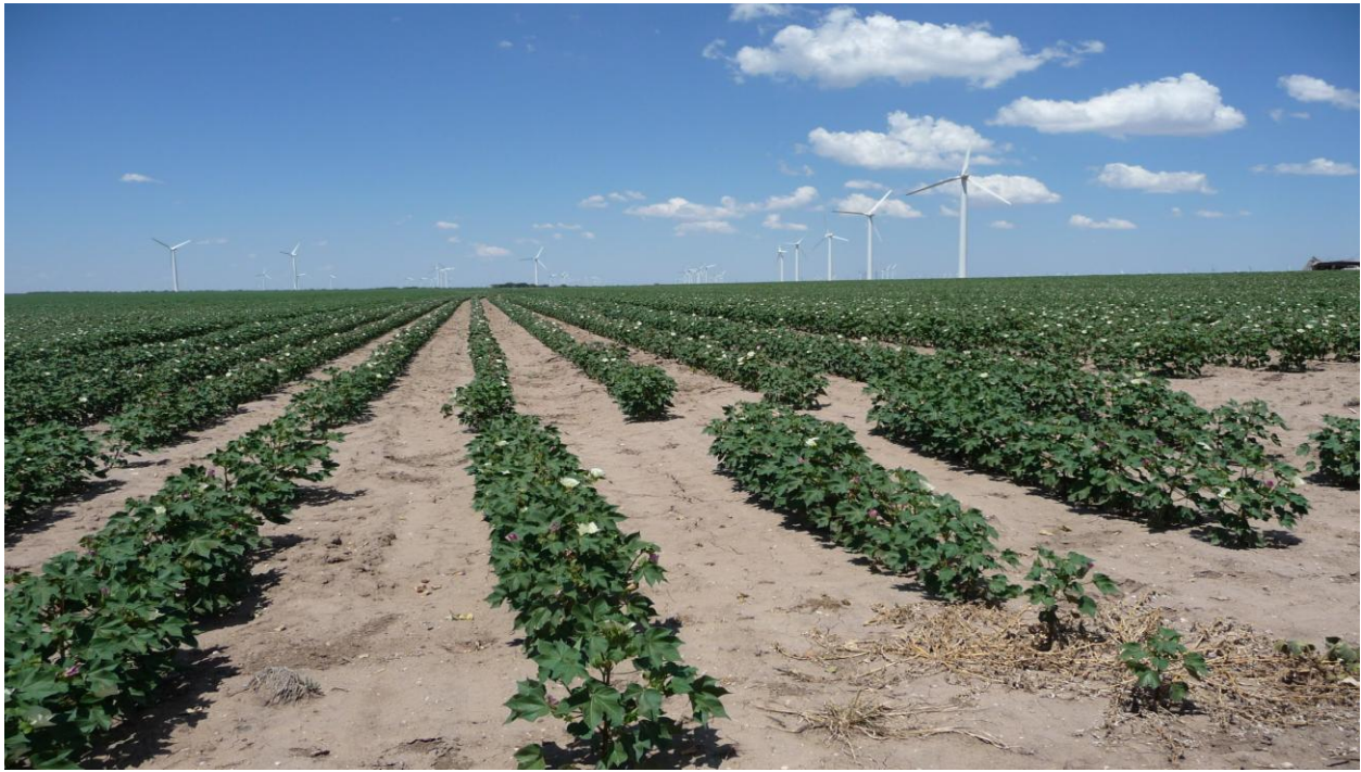
Modern clean farming eliminates nesting and brood habitat

Agricultural Lands - Increase the amount and enhance the quality of nesting, brood-rearing, escape and roosting cover for bobwhites and other grassland wildlife on agricultural lands, through the establishment and/or management of native warm-season grasses, forbs and shrubs.