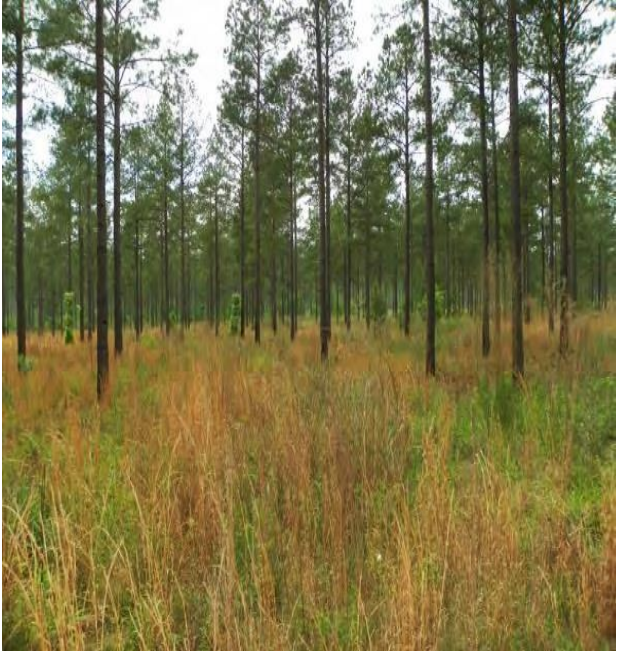
Loblolly CRP 50 ft 2 basal area, burned w/ 2-yr frequency and with quality ground cover