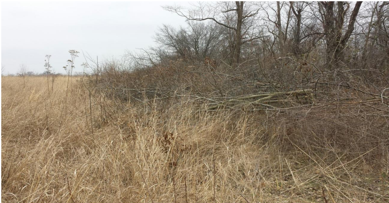
Edge feathering

or patch planted to corn, milo, millet, forage sorghum, soybeans, cowpeas or other grains is sufficient on each 40 acres of habitat. When feasible long, linear food plots are preferred over block plantings. Consider rotating food strips across the area each year by leaving half of each plot idle and planting the other half. The idle area provides excellent brooding cover. Food plots in grazed grasslands must be fenced from livestock. Food plots are most effective when established adjacent to protective woody cover and diverse grass and wildflower stands.