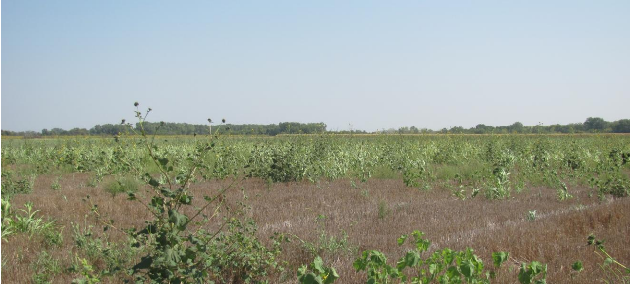
Midwest fallow wheat field with good food and cover for quail

Fallowing – Land managers should consider idling field edges or whole fields for one to five years to provide high quality cover. Fallowing fields is an effective and economical way to provide high quality cover at little or no cost. Idle field borders should be at least 30 feet wide and preferably 60 to 180 feet wide. In most cases idle areas should be allowed to revegetate in annual plants; however a light seeding of annual lespedeza or alfalfa can improve brood-rearing habitat. Land managers interested in maximizing quail habitat should periodically fallow entire crop fields. Fallow field borders and crop fields should be periodically farmed to setback plant succession. To be more effective, fallow areas should be adjacent to shrubby cover.