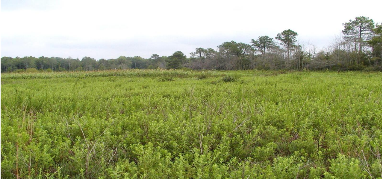
Southeast fallow field with good annual plants overhead cover

Fallowing – Land managers should consider idling field edges or whole fields for one to five years to provide high quality cover. Fallowing fields is an effective and economical way to provide high quality cover at little or no cost. Idle field borders should be at least 30 feet wide and preferably 60 to 180 feet wide. In most cases idle areas should be allowed to revegetate in annual plants; however a light seeding of annual lespedeza or alfalfa can improve brood-rearing habitat. Land managers interested in maximizing quail habitat should periodically fallow entire crop fields. Fallow field borders and crop fields should be periodically farmed to setback plant succession. To be more effective, fallow areas should be adjacent to shrubby cover.