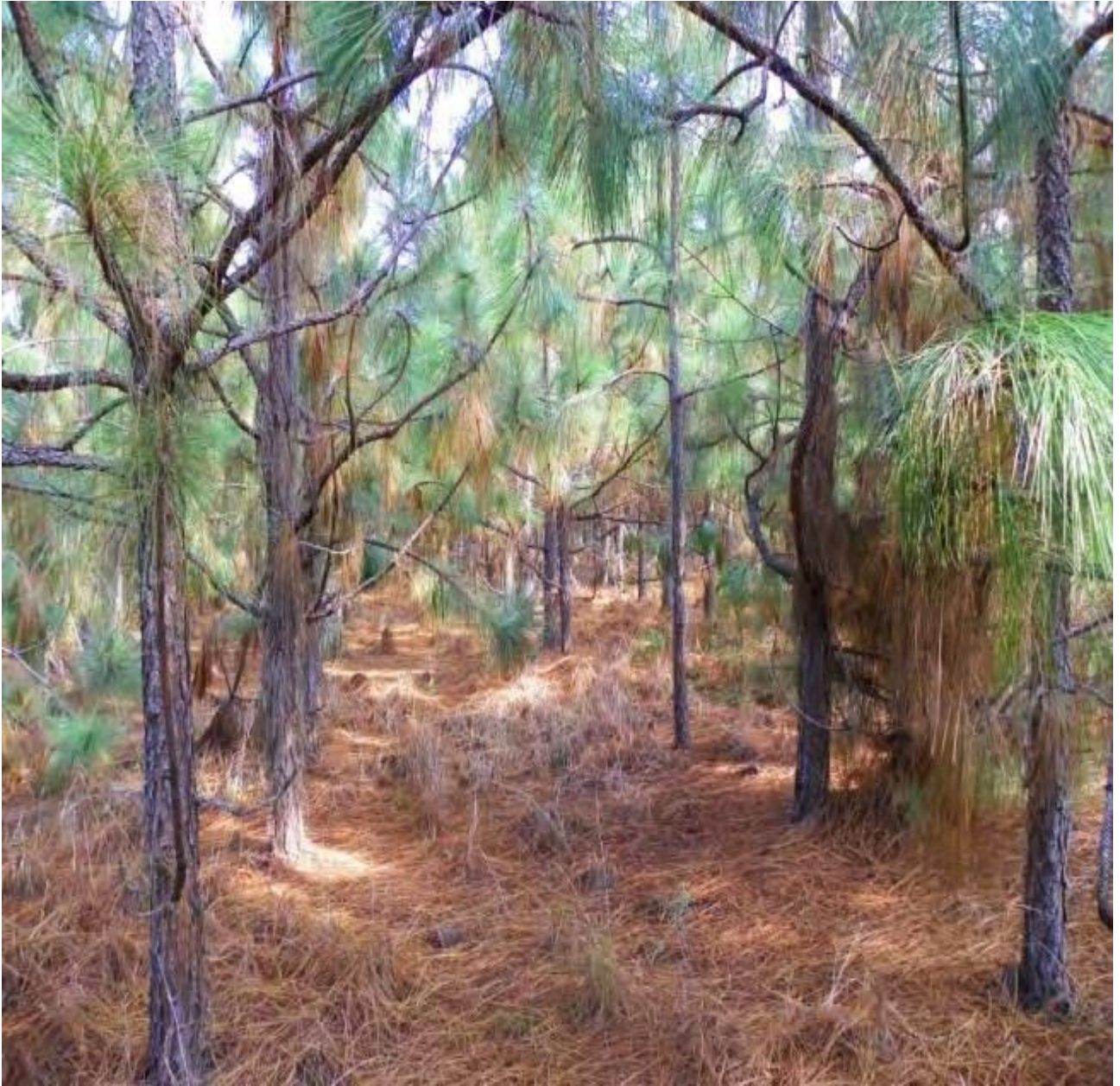
CRP CPA 10 Years Old Never Burned – no ground cover and poor quality trees - photo by Reggie Thackston GADNR