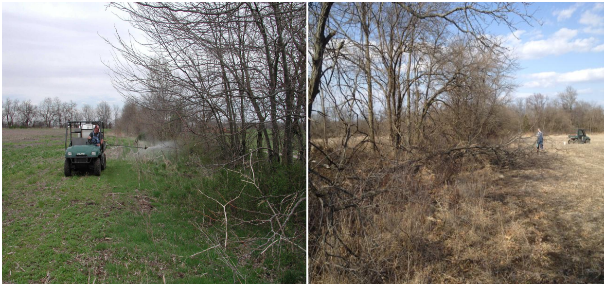
Controlling undesirable vegetation before edge feathering

Consider planting 2 or 3 rows of low-growing shrubs and adjacent native grass field borders on the outside edges of riparian buffers to improve quail habitat. Establishing contour buffer strips in crop fields through continuous CRP is an effective way to improve habitat arrangement for quail in intensive agriculture landscapes. Contour buffer strips should be 20 to 30 feet wide and established to native warm-season grasses, wildflowers and legumes. Where feasible, plant shrub thickets, or allow the development of native thickets, in or along the contour buffer strips to provide suitable protective cover.