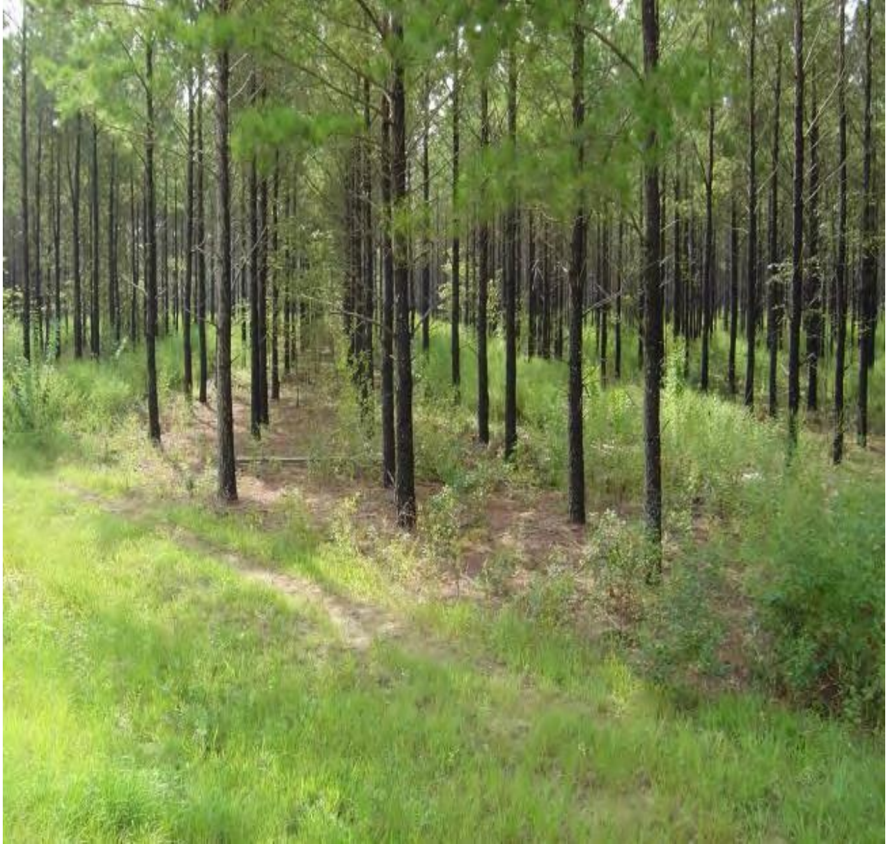
Thinned & Burned, 80-100 ft 2 basal area

Typical results of 5th-row thinning when timber management is the main objective. Increased sunlight penetration in take-out rows allows for increased ground cover but ground cover is too thin between other rows, which decreases food and cover and increases vulnerability to predation. Burning this stand results in some wildlife benefits but more sunlight is needed produce and sustain quality ground cover. A heavy within-row selection of trees will be needed in the next thinning to restore and sustain ground cover