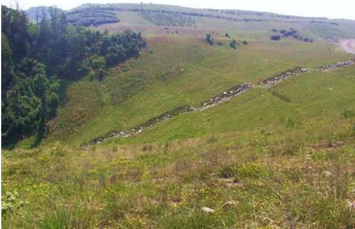
Reclaimed mine valley fill planted in fescue and autumn olive

Invasive Plant Control – Historically, a variety of nonnative and aggressive plants were planted on reclaimed mine lands. In the past, invasive species such as Japanese honeysuckle, sericea lespedeza, tall fescue, autumn olive and black locust were planted. Invasive plants crowd out important quail friendly plants, negatively impacting habitat structure for quail. Depending on management objectives, infested sites should be annually checked for new stands of unwanted plants. However, large-scale control measures may not be feasible due to past management. If left unchecked, invasive vegetation can overtake desirable vegetation and plant structure.