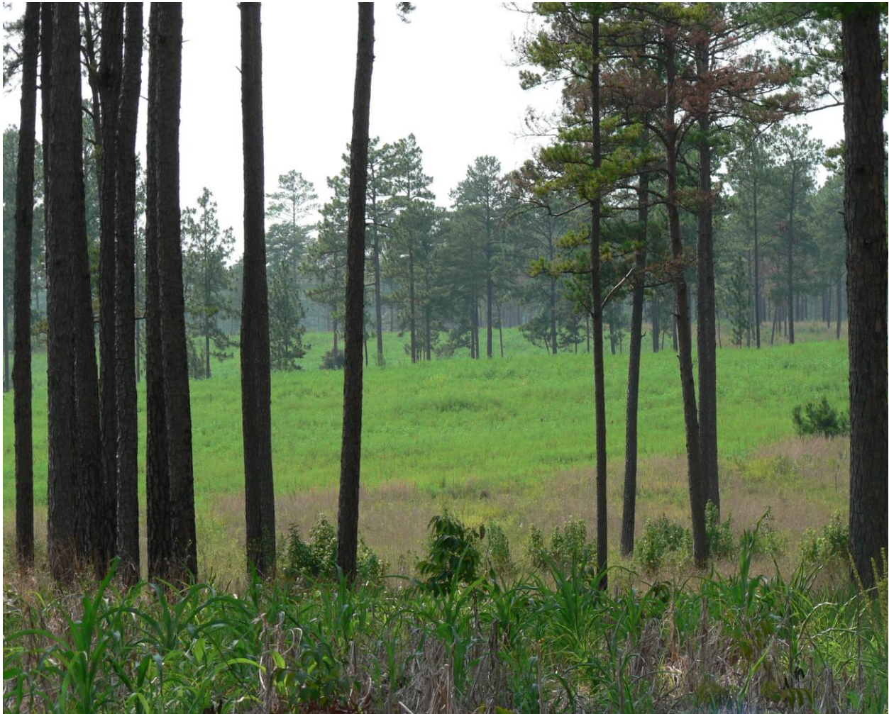
Well managed forest opening

percent of the quail range should be in 3 to 5 acre fields that are evenly distributed throughout the woodland. As a rule of thumb, land managers should aim for one forest opening per 10 to 20 acres. When creating new forest openings, all marketable timber should be harvested from the site. After harvest, fields should be cleared with heavy machinery, making sure stumps and unmarketable timber are piled and burned.