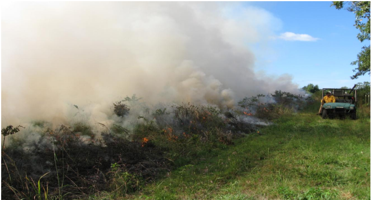
Using prescribed burning to maintain a field border

If desirable native vegetation such as native grasses and wildflowers are present consider managing the existing stand instead of establishing more native grasses. Remnant stands can be rescued by eradicating undesirable cool-season grasses in the fall after a killing frost or by applying selective herbicides such as Imazapyr or Imazapic on introduced warm season grasses during the growing season. Make sure to read and follow label directions when applying herbicides. It is difficult and expensive, if not impossible to salvage native vegetation on many sites infested with exotic warm-season grasses.