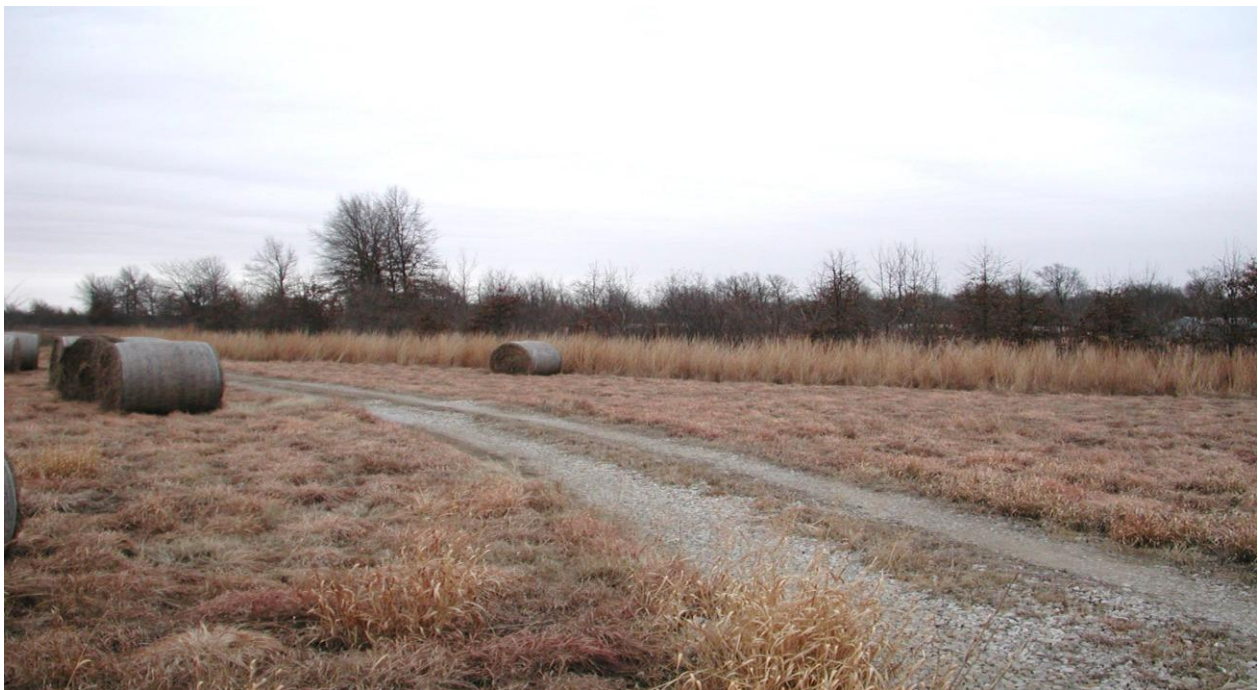
Unhayed border left for wildlife

Managed Grazing and Haying – Applied properly, grazing can create and maintain quality quail habitat, which includes the interspersions of nesting, brooding and shrubby cover. Generally, a pasture should be left undisturbed from grazing and haying activities for a minimum of 60 days to provide adequate time for a hen to initiate and hatch a nest. Quail prefer to nest in clumps of undisturbed grass with the previous year's growth and at least 8 inches tall to conceal nests and in close proximity to brood-rearing cover. Land managers should consider deferring grazing in one or more paddocks during the spring and early summer nesting season. These paddocks can be reserved for late summer and winter forage.