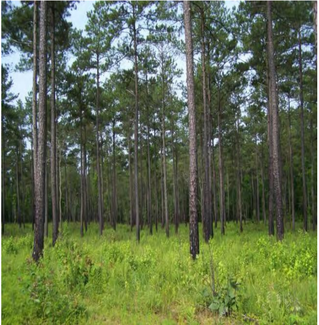
Loblolly Pine Savanna In Restoration – 60 ft 2 basal area and quality timber/bobwhite habitat