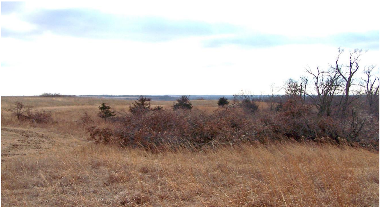
Brushy draws in pastureland settings provide needed cover – photo courtesy of IDNR

Increase the amount of native grass and wildlife-friendly forbs and legume plantings in pastures and hayfields to provide adequate nesting and brood-rearing cover. Delay or modify haying and grazing practices to allow adequate time for nesting and brood-rearing. Enhance shrubby cover and woodland edges for bobwhites.