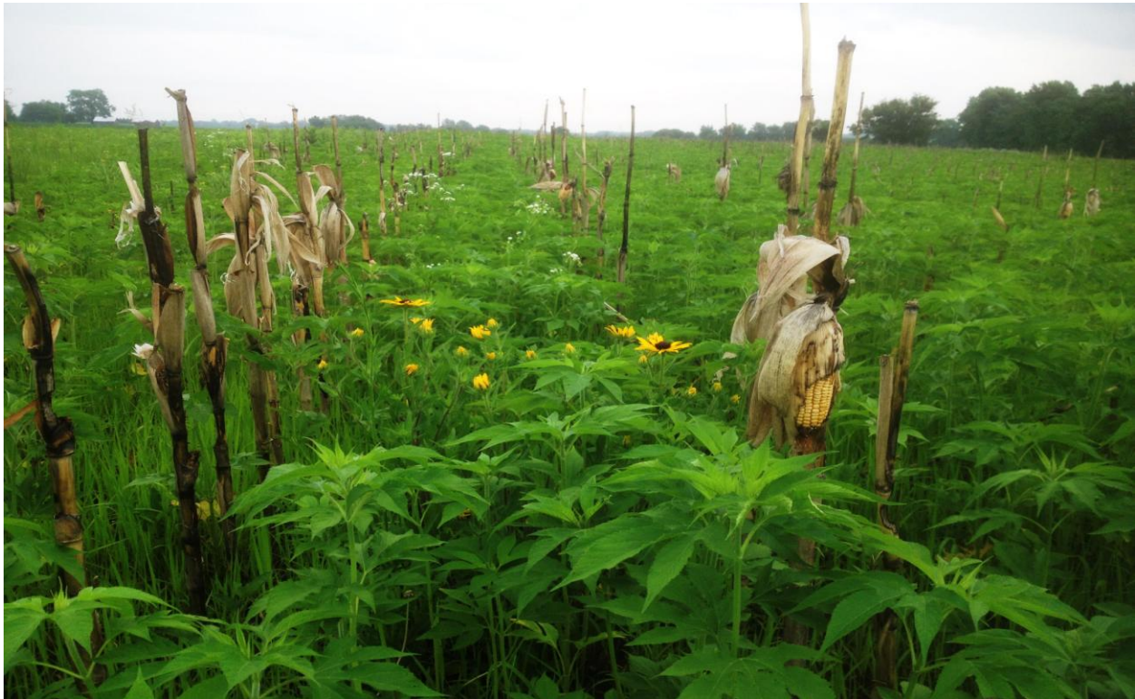
Previous year's food plot with excellent brood habitat

improved for by eradicating all existing vegetation, including native grasses and wildflowers. Native grasses and wildflowers can be reestablished once the invasive vegetation has been eradicated. To prevent future reinfestations, land managers are encouraged to spray areas adjacent to the field border and underneath trees and shrubs. Use of a boomless sprayer is an effective way to target invasives in these areas.