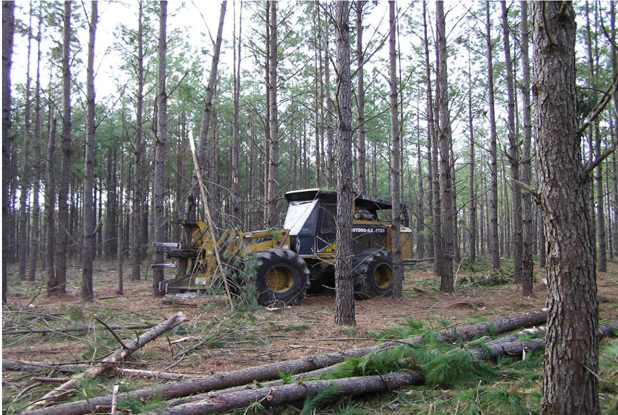
Logging operation