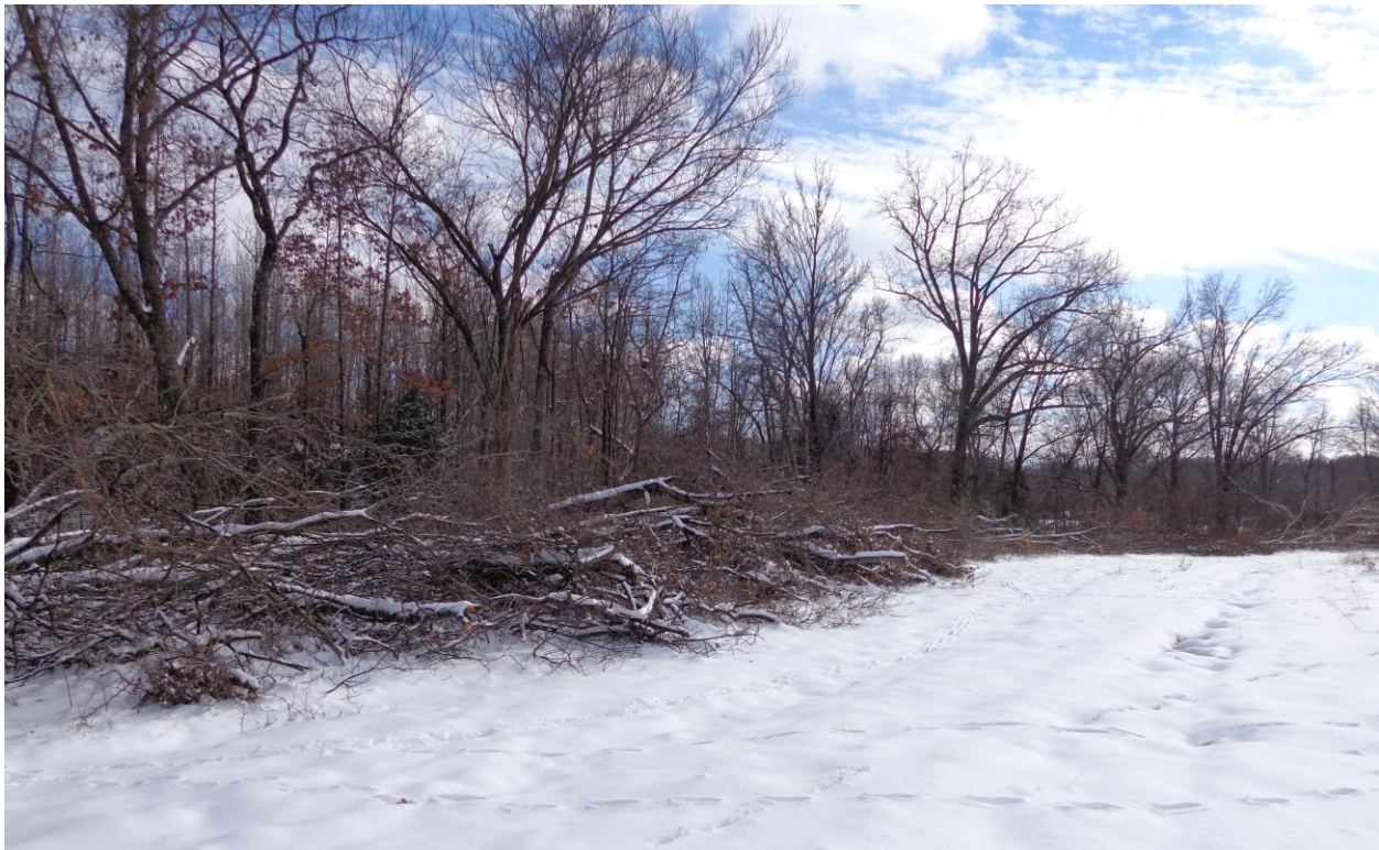
Example of edge feathering

Shrubby Cover Enhancement – During the winter, coveys will often establish a headquarters area and loafing site around one or more shrub or low-growing woody cover sites. Patches of shrubby or woody cover should be spaced 50 to 100 yards apart and at least 30 to 50 feet wide. Where quail habitat is the primary objective, native grasslands and CRP fields wider than 100 yards should be divided with tree or shrub corridors for maximum bobwhite benefits. Shrub rows should be at least 10 to 30 yards wide. Native shrubs such as wild plum, shrub dogwood, blackberry and hazelnut make excellent shrubby cover. Shrubby cover should be fenced from livestock to avoid degrading this important cover type. Land managers should take advantage of continuous CRP marginal pastureland practices such as CP22 Riparian Forest Buffer and CP29 Marginal Pastureland Wildlife Habitat Buffer to establish favorable shrubby cover patches.