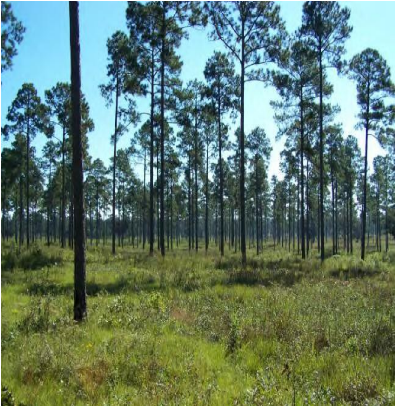
Mature Loblolly Pine Savanna showing intensive bobwhite management with less than 40ft 2 basal area, fallow fields and 2- year fire frequency