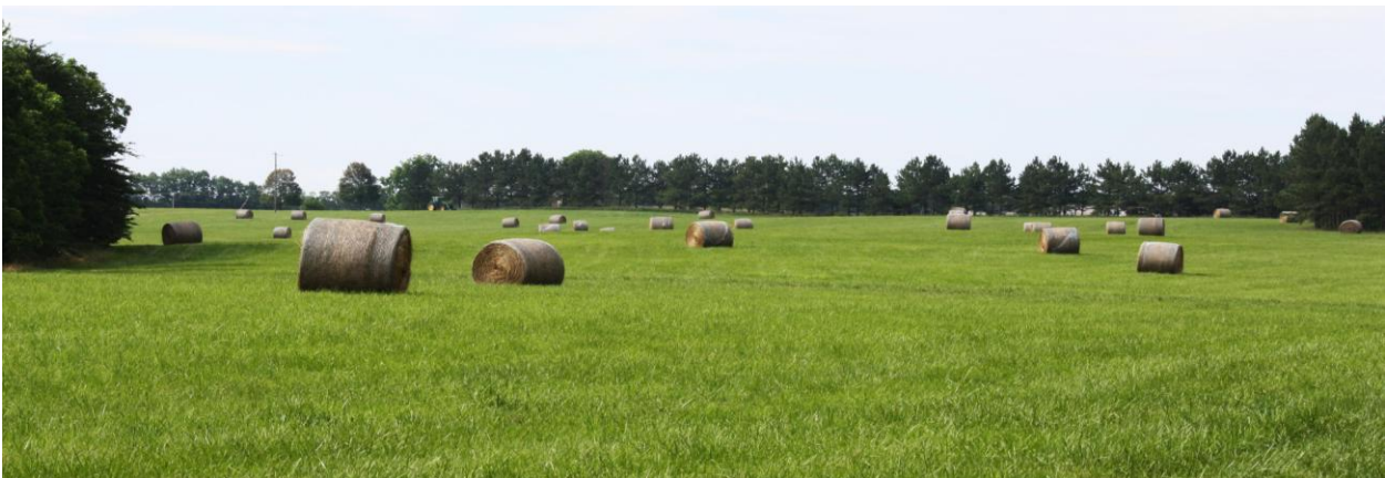
Frequently harvested fescue hay pasture - photo by Marc Puckett, VDGIF

Pastures and hay fields established to “tame” grasses such as tall fescue, smooth brome, Bermuda grass, and bahia grass provide extremely poor habitat for quail because these forages do not provide adequate structure for nesting and brood-rearing. Current intensive grazing systems using monocultures of introduced grass do not provide adequate nesting cover, plant diversity and bare ground for brood cover. -In addition, most intensive grazing systems are grazed too frequently or at too high stock density for a hen quail to nest, lay 12-15 eggs, and incubate them for 21-23 days without either being trampled by livestock or having all the cover removed. Another common problem is nesting cover may not be located near brooding cover – if successful, a quail may have nowhere to take a young brood after they hatch (consider what biologists learned from the radio collared quail and the fact that a day old quail chick is no bigger than a quarter). -Continuous, severely grazed pastures normally will not provide nesting or brooding cover for quail. -Introduced sod forming grasses also become too dense when rested to allow movement by quail chicks and their lack of diversity provides little in the way of the weed seeds and insects that the chicks need.