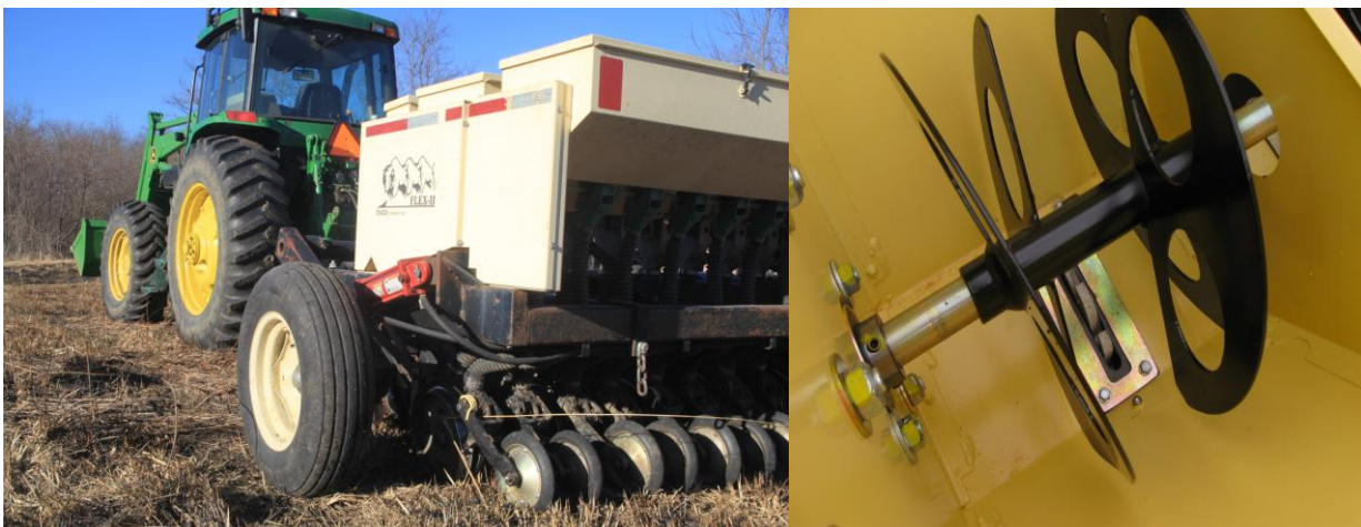
A special planter, often with multiple seed boxes and an agitator that allows the use of fluffy seeds, is needed for planting many native grasses and forbs

Native grasses and wildflowers may be established during the dormant season or spring. The light, fluffy seeds will require special seeding equipment or unique seeding methods such as the winter planting shown in Scott James', Quail Forever photo below to effectively distribute the seed across the field. Good results can be expected when seeds are broadcast or planted with a no-till drill if proper seedbed preparation and adequate rainfall occur. Newly established native grass and wildflower plantings should be periodically mowed to a height of 6 to 10 inches during the first year to reduce weed competition and promote their growth. Warning: Mowing should not be used as a long-term management practices as mowing does not create favorable habitat conditions and plant structure for quail. Selective herbicides can help reduce weed competition and thereby reduce stand establishment. Warning: Imazapyr can damage some native grasses and wildflowers. A good stand can be expected by the 2, 3 or 4 growing season depending on weed control measures, site conditions and climate.