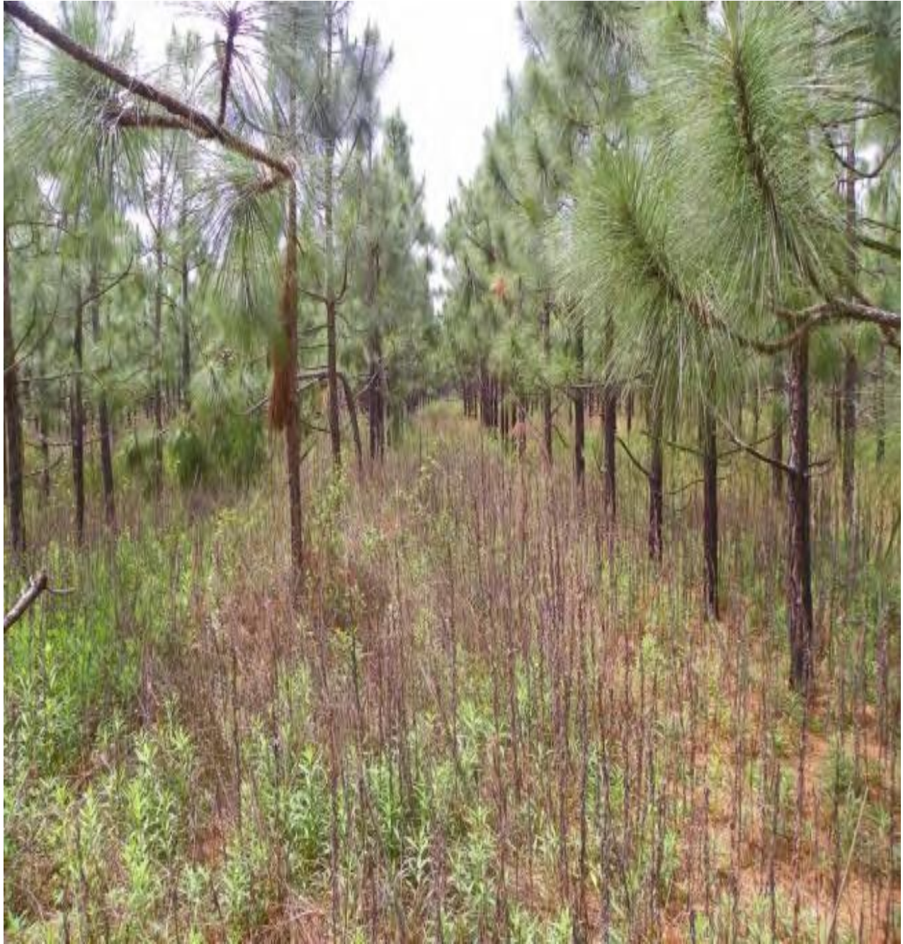
9 Years Old CRP Burned Twice in the Last 4 Years – improved ground cover and lower limbs are being pruned to enhance tree quality – ground cover and tree quality could have been further enhanced if burning had begun in year 2