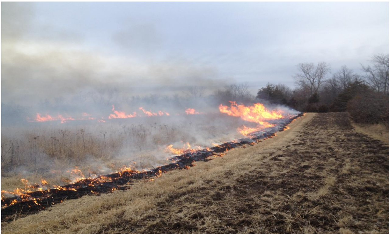
Periodic disking and burning has many benefits – photo by Jef Hodges NBCI

Disking should result in 30 to 70% bare soil. In many cases, dense, rank stands of vegetation must be burned, hayed or mowed prior to disking. The combination of management activities will help create different plant responses and vegetative structure in the grassland. Late summer, fall, or winter disking tends to favor broadleaves such as ragweed and croton, while spring disking tends to favor less desirable annual grasses such as foxtail and crabgrass. The disked areas will produce succulent forbs and legumes, which attract insects and produce abundant seed, while the adjacent undisked areas will provide nesting and roosting cover. Some programs require disking only during specified dates.