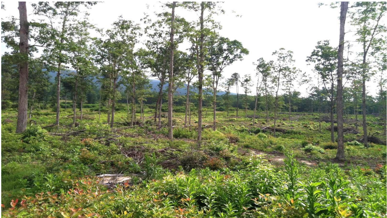
Recently heavily thinned woodland

Oak and Pine-Oak Woodland Thinning – A variety of silvicultural practices can be used to restore degraded oak and pine-oak woodlands. As a general rule of thumb, woodland sites should be thinned to between 20 and 50 square feet of basal area/acre to provide favorable habitat conditions for northern bobwhite. An open woodland canopy should be open enough