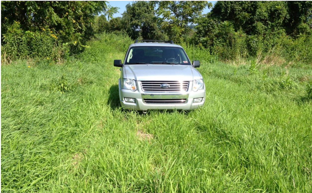
Site invaded by reed canary grass

Livestock Exclusion – Protect idle areas, woodlots, woody draws and food patches from heavy or continuous livestock grazing. Allowing desirable native grasses, forbs and shrubs to develop can provide good nesting, brood-rearing and protective loafing cover along the edges of pastures and hayfields.