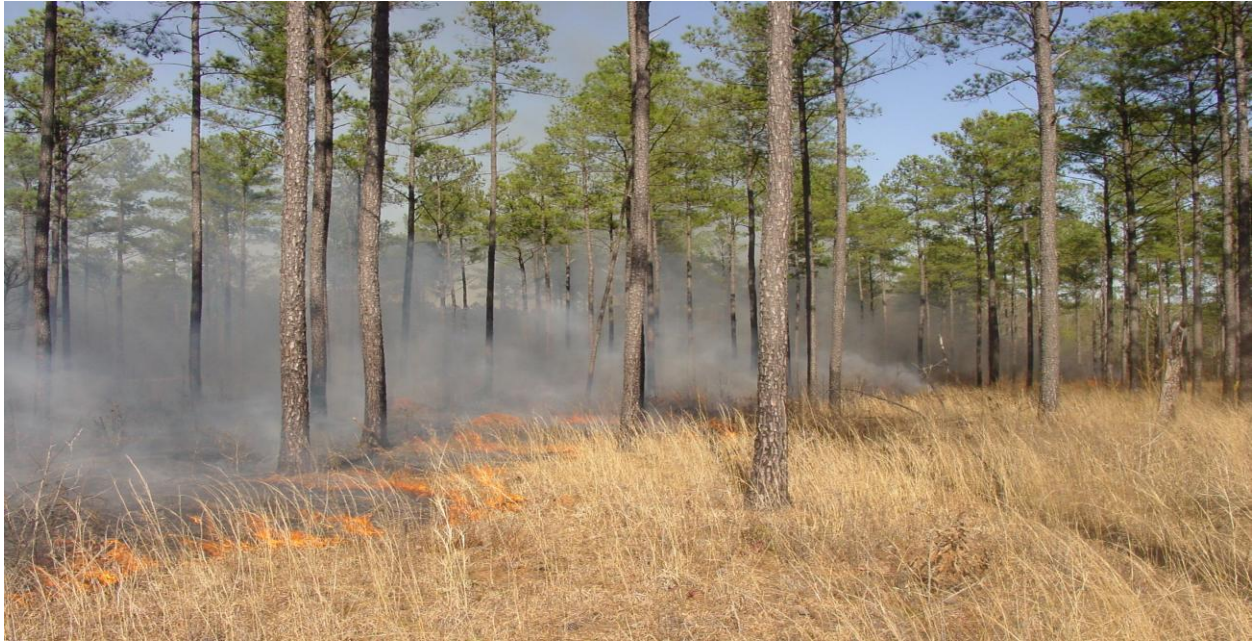
Frequent burns are essential in pine forests – photo by Reggie Thackston, GADNR

Prescribed Burning – Frequent prescribed burns are essential in pine forests to control hardwood sprouts and encourage desirable native grasses, legumes, forbs and shrubs used by quail. Land managers should apply fire to a portion of pine woodlands annually to maintain suitable cover for quail. Mowing of invasive hardwoods immediately following burns and/or selective herbicide applications is often necessary for adequate control of undesirable vegetation. Whenever possible, land managers should use herbicides that minimize damage to desirable native grasses, forbs and shrubs. Across sites of moderate to high fertility prescribed fire should be applied on a 2 year frequency where 50% of the burnable woods are burned each year. On very infertile sites and especially during drought years a 3 year burn frequency may be sufficient. If left unchecked, hardwood sprouts can quickly shade out desirable plants, and will often require mechanical and chemical treatments once in the mid or overstory.