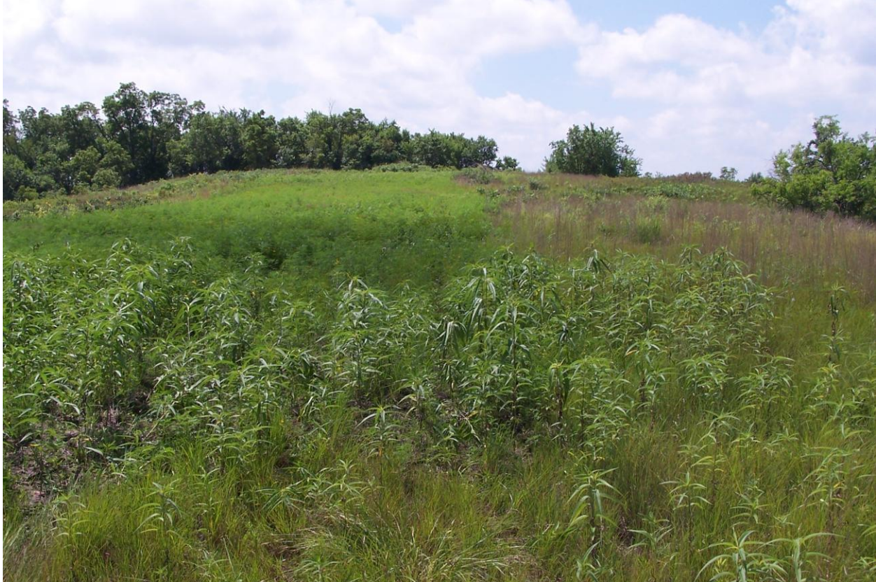
Fall strip disking encourages forb growth

Strip Disking (Wildlife Disking) – Fall or winter strip disking of planted or fallow field borders and idle corners creates a mosaic of disturbed and undisturbed areas. Once the field border is well established disturb 1/3 of the field border or idle areas each year. No more than 1/3 of the area should be disturbed annually since nesting cover is often a limiting factor in agricultural landscapes.