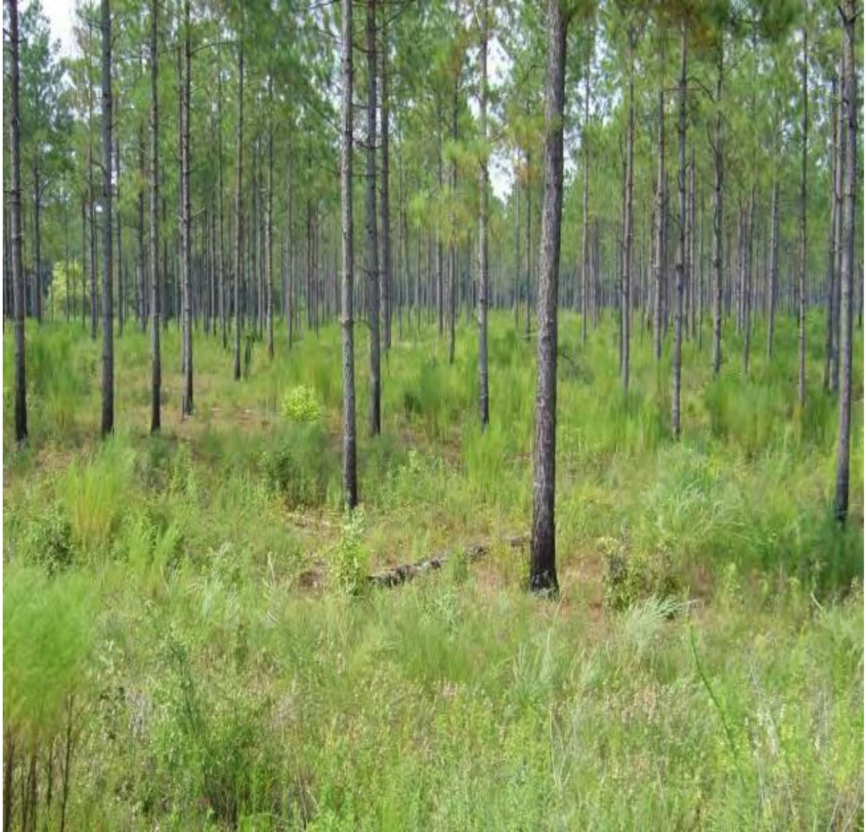
Thinned & Burned, 60-80 ft 2 basal area

This is an acceptable timber stocking for deer, turkeys and other habitat generalists. The increased sunlight coupled with frequent burning results in improved ground cover structure and composition, providing nesting and brooding cover for turkeys and quality forage and fawning cover for deer. Gaps in ground cover are still predominant, which makes bobwhites vulnerable to predation especially during winter months. Ground cover will decrease as tree canopy quickly closes and reduces sunlight with the end result being limited value to bobwhites.