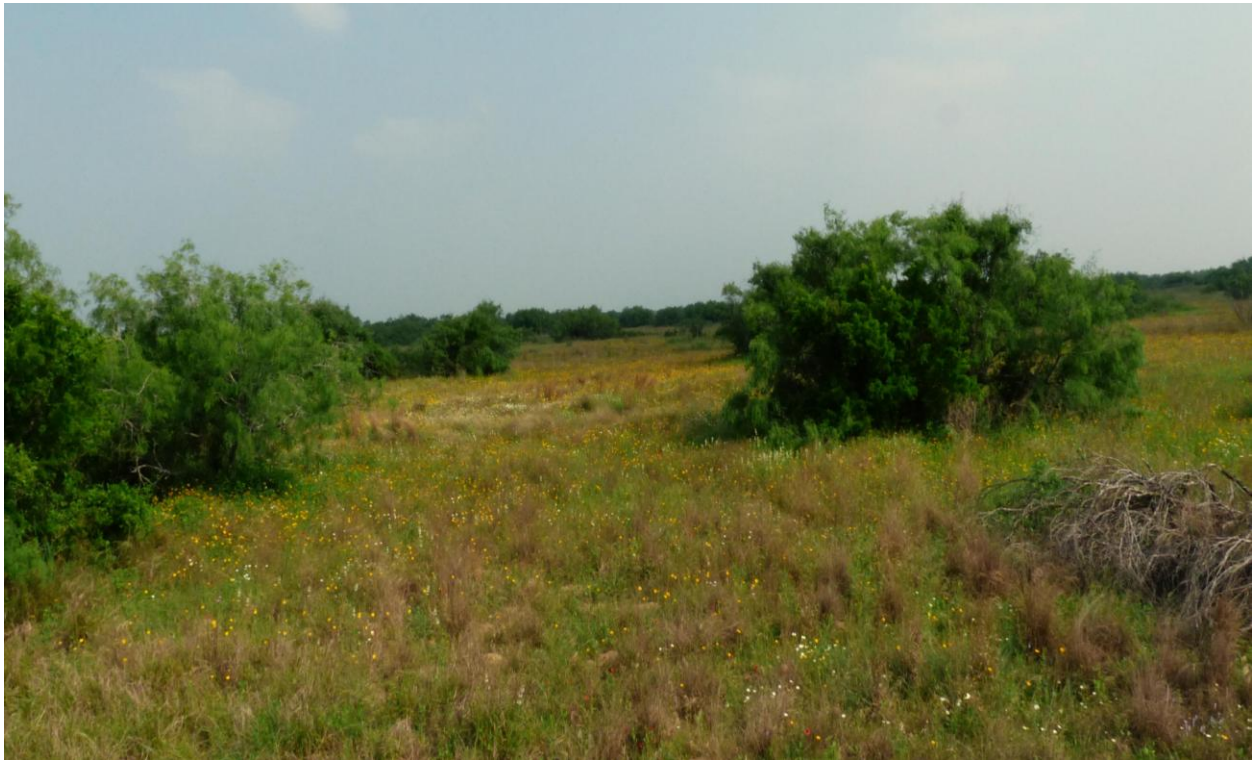
Selected brush removal combined with careful grazing

Land managers interested in enhancing quail habitat should fine tune brush control practices by selectively removing brush across the landscape while maintaining patches of protective woody cover. As a rule of thumb, patches of shrubby cover should be scattered across the landscape with no more than 50 yards between clumps. Species that provide good protective cover as well as seasonal food include sumac, dewberry, shin oak, wild plum, lotebush, sand sagebrush and mesquite. Care should be used in broadcast applications of herbicides for brush control. Many herbicides are nonselective and may eliminate broadleaf forbs critical for seed and insect production and desirable woody loafing and escape cover. Ideally herbicides should only be applied to the targeted invasive species. If that is not feasible consider applying herbicides in alternating strips or crosshatching (think tic-tac-toe) with untreated and partially treated areas left between the treated overlapping junctions.