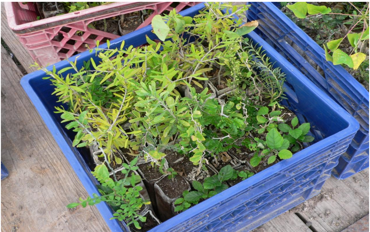
Assorted native shrubs in planting tubes

area should be felled, making sure native shrubs are left undisturbed. An occasional tree may be left to preserve valuable timber or mast producing species. Generally, treat all cut stumps with an approved herbicide to prolong the benefits of edge feathering. If possible, leave felled trees where they fall. Edge feathered trees may be dropped parallel to the fence line/field edge or cut and loosely stacked along the edge of the field. Do not push the downed trees into a dense brush pile. Edge feathering may be completed with a chainsaw or mechanical clipper.