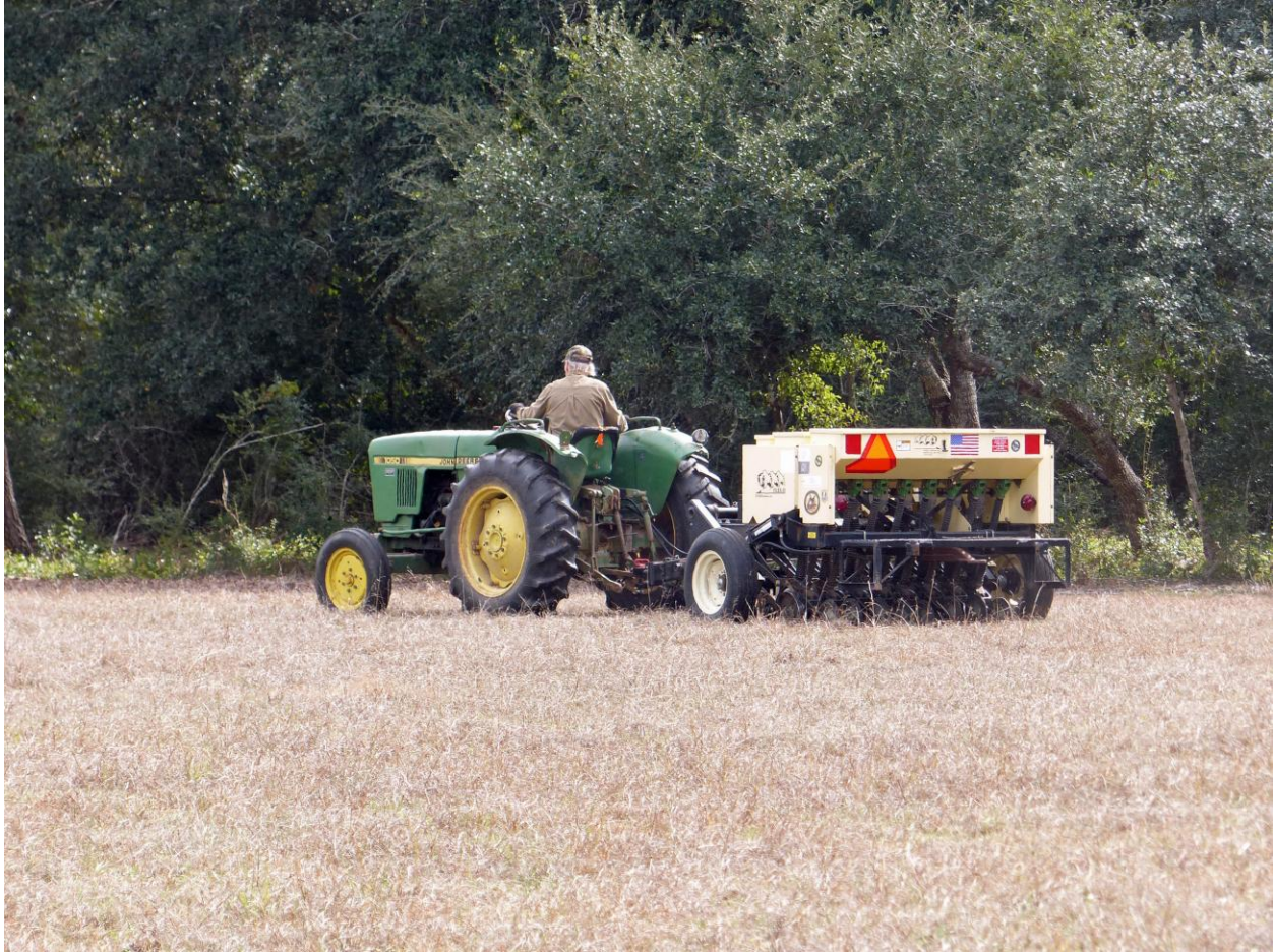
Interseeding CRP to increase plant diversity

Interseeding – In native grasslands and established CRP fields interseeding native wildflowers (5 to 20 species mix) and/or legumes such as alfalfa and annual lespedeza will improve plant diversity. Native prairie and savanna remnants should only be overseeded with local ecotype seed. Native wildflowers and desirable legumes provide ideal brood-rearing cover and excellent food sources. Best success occurs immediately after a disturbance such as prescribed burning, strip disking, managed grazing or herbicide application. Native wildflowers and legumes can be seeded by broadcast methods or with a no-till drill. Native wildflowers should be planted at the rate of 1 to 5 PLS pounds per acres and dormant seedings are preferred over spring seedings. Legumes should be seeded at the rate of 1 to 5 PLS pounds per acre.