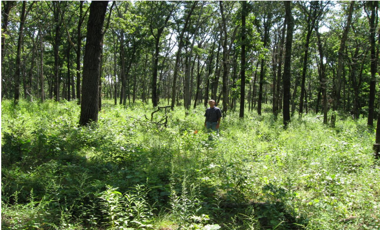
Thinned oak woodland with good light penetration

to allow 50% full sunlight at ground level at mid-day (measured when leaves are on the trees). An open overstory and a sparse midstory are critical to promote native grasses, forbs and legumes for nesting and brood-rearing cover. Combinations of these cover types also produce seed bearing plants that provide winter feeding areas.