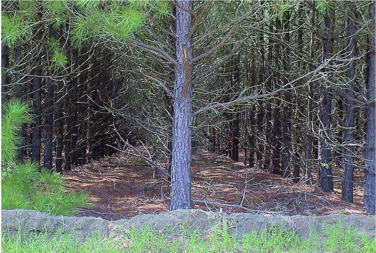
Overstocked Pine Plantation with closed canopy

Pine Forests - Enhance and increase nesting and brood-rearing habitat in pinelands and mixed pine-hardwood forests by thinning, controlled burns, site preparation and forest regeneration in a fashion that benefits bobwhites and other wildlife.