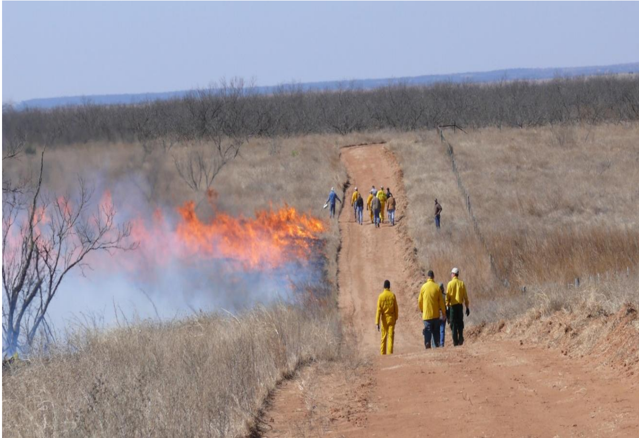
Cool season prescribed burn to invigorate native grass and forb production and reduce invasive mesquite at TPWD's Matador WMA

Prescribed Burning – This is an economical tool to control excessive brush and maintain favorable habitat conditions for quail and forage for livestock in regions of sufficient rainfall (>20"). However, improperly applied large scale burning on native rangelands may negatively impact quail densities by limiting the amount of nesting cover. Larger burns can be performed if they are patchy in nature or contain small 1 to 5 acre upland sites that are left with adequate nesting cover (at least 8-10 inches tall) scattered throughout the burn unit. Care should be taken to protect shrubby escape or loafing cover and other desirable woody plants through the use of fire breaks or black lines. Land managers interested in enhancing and improving quail habitat should avoid annual burning on the same acreage. Burning on a two to six year rotation is generally recommended based on climate, soil fertility and grazing rotations. Prescribed burns from late winter to "green-up" provide the most benefit for native warm season grass stands. May-September burns are preferred for controlling invasive woody species although winter burns are also effective at reducing woody plant cover. Young stands of non-sprouting species such as eastern red cedar and Ashe juniper are most effectively managed with prescribed fire, whereas resprouting species including mesquite and red berry juniper will require maintenance treatments. Early winter burns, after the first frost, are best for