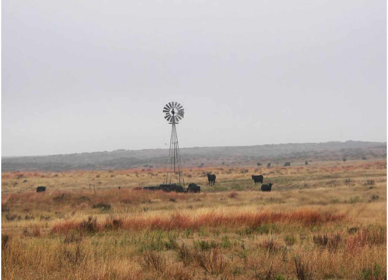
Well managed native rangeland

Land managers interested in enhancing and maintaining habitat for quail should consider conservative stocking rates, especially in areas of low annual rainfall, in order to maintain this mix of good vegetative structure. Research indicates nesting quail select areas with taller, denser grass clumps. Cattle should be deferred from rangelands when native bunchgrasses are reduced to less than 200 clumps per acre and/or are less than 8 inches tall. Grazing strategies that maintain at least 700 grass clumps/acre over 10 inches tall are ideal. On rangelands where the species composition does not currently support desired grasses for nesting cover, more intensive restoration methods may be needed. These include specialized grazing management designed to restore mid and tall grasses – such as multi pasture single herd rotations (4 Pasture – 1 Herd), complete destocking of livestock for a period of time, control of invasive grasses or woody species, reseeding native grass species and brush management. If a suitable density of desired grass species exists, then a lower level of grazing management may suffice to maintain the desired density of ground cover. Periodic destocking may still be necessary to maintain desirable nesting cover depending on local conditions.