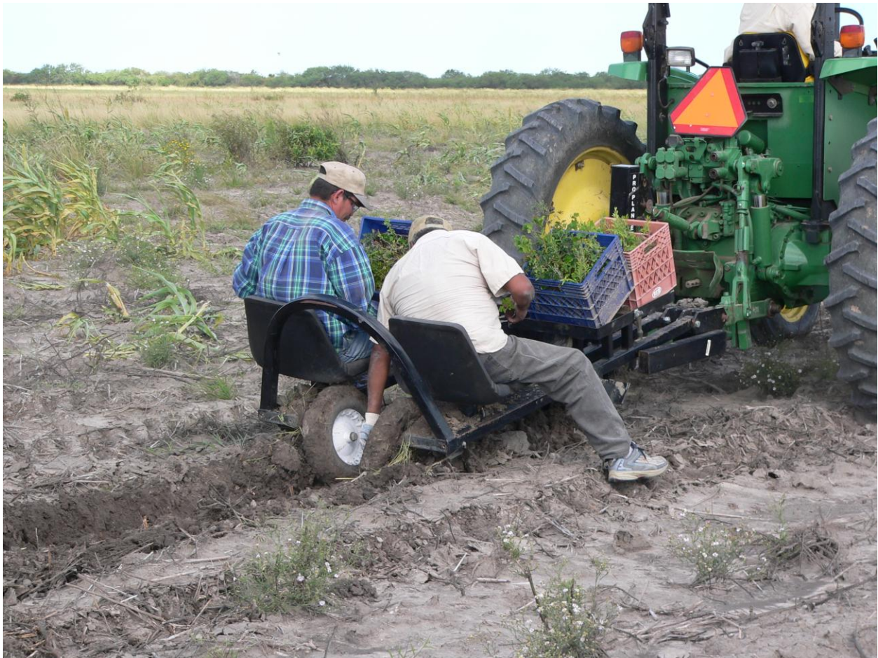
Native shrub planting in a recently farmed field

or cut and loosely stacked along the edge of the field. Do not push the downed trees into a dense brush pile. Edge feathering may be completed with a chainsaw or mechanical clipper.