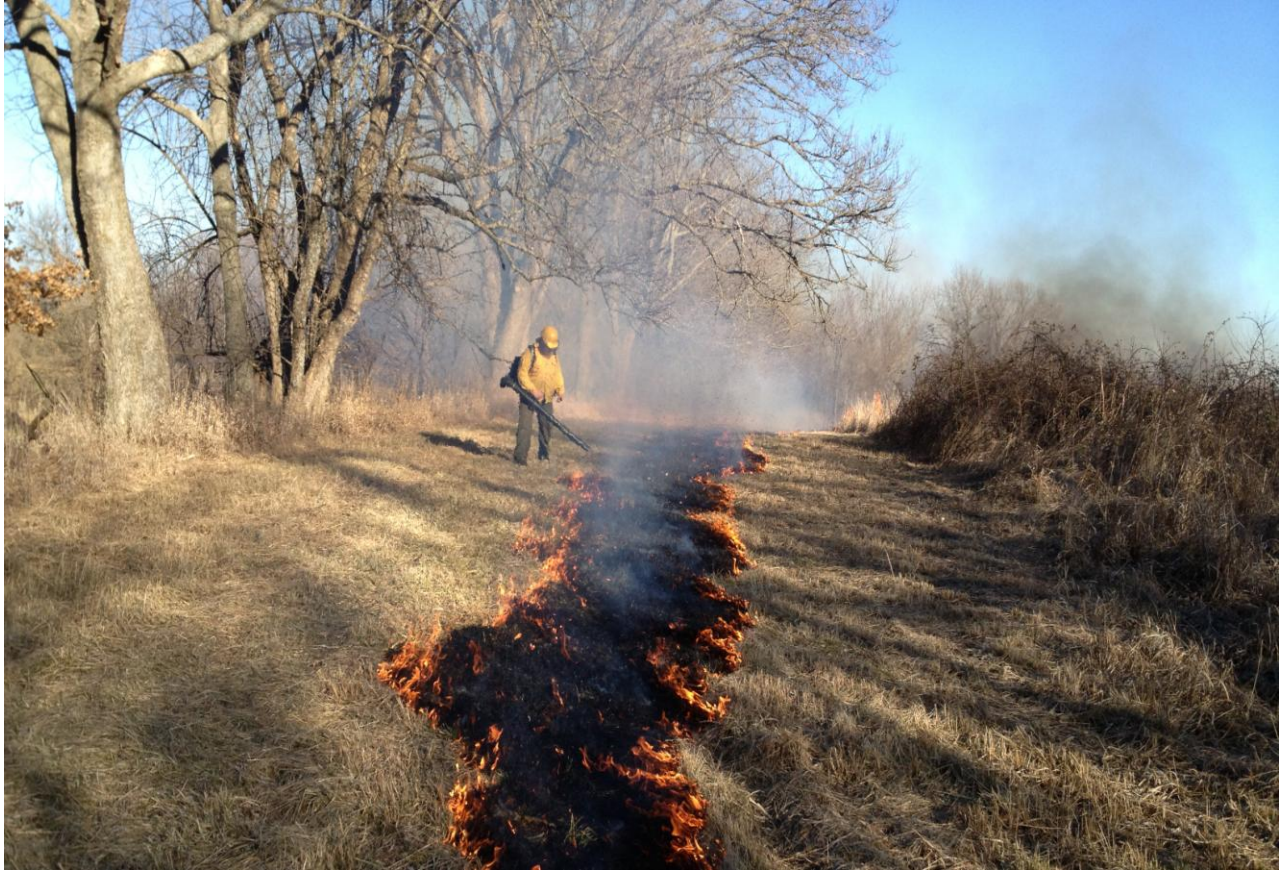
Prescribed burning benefits odd corners of habitat

Prescribed Burning – Should be used to maintain desired cover in field borders, buffers and idle corners. Prescribed burning helps stimulate quail-food plants and plant structure. As a general rule of thumb, no more than 1/3 of field borders or idle areas should be burned each year, especially in agricultural landscapes where nesting cover may be a limiting factor for quail. Depending on the vegetative cover field borders, buffers and idle areas may be burned any time of the year, with the exception of during the spring and early summer nesting season.