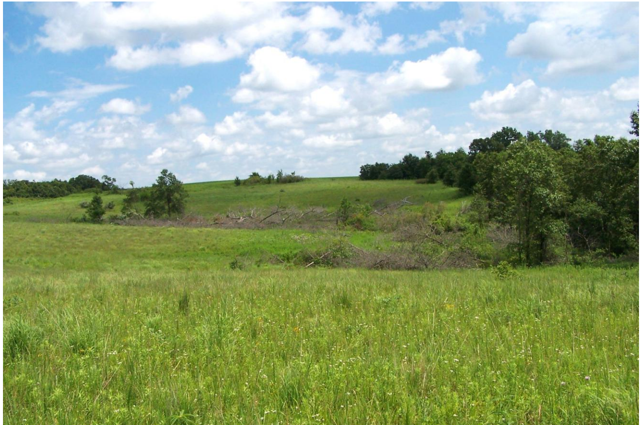
Edge feathering a field

cover should be at least 30 to 50 feet wide and spaced 20 to 100 yards apart. Where quail habitat is the primary objective, crop fields wider than 100 yards should be divided with tree or shrub corridors for maximum bobwhite benefits. Shrub rows should be at least 10 to 30 yards wide. Native shrubs such as wild plum, sumac, shrub dogwood, blackberry and hazelnut make excellent shrubby cover for bobwhites.