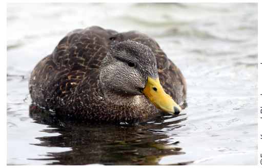
American black duck.

After more than 30 years of 1-bird daily bag limits for black ducks, duck hunters in the U.S. will have an opportunity for a 2-black duck daily bag limit in 2017. Why the change after all these years? Three developments led to this shift.